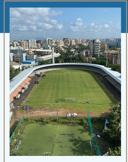
Actual view from flats