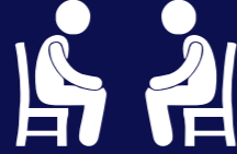
Senior Citizen Sitting Area