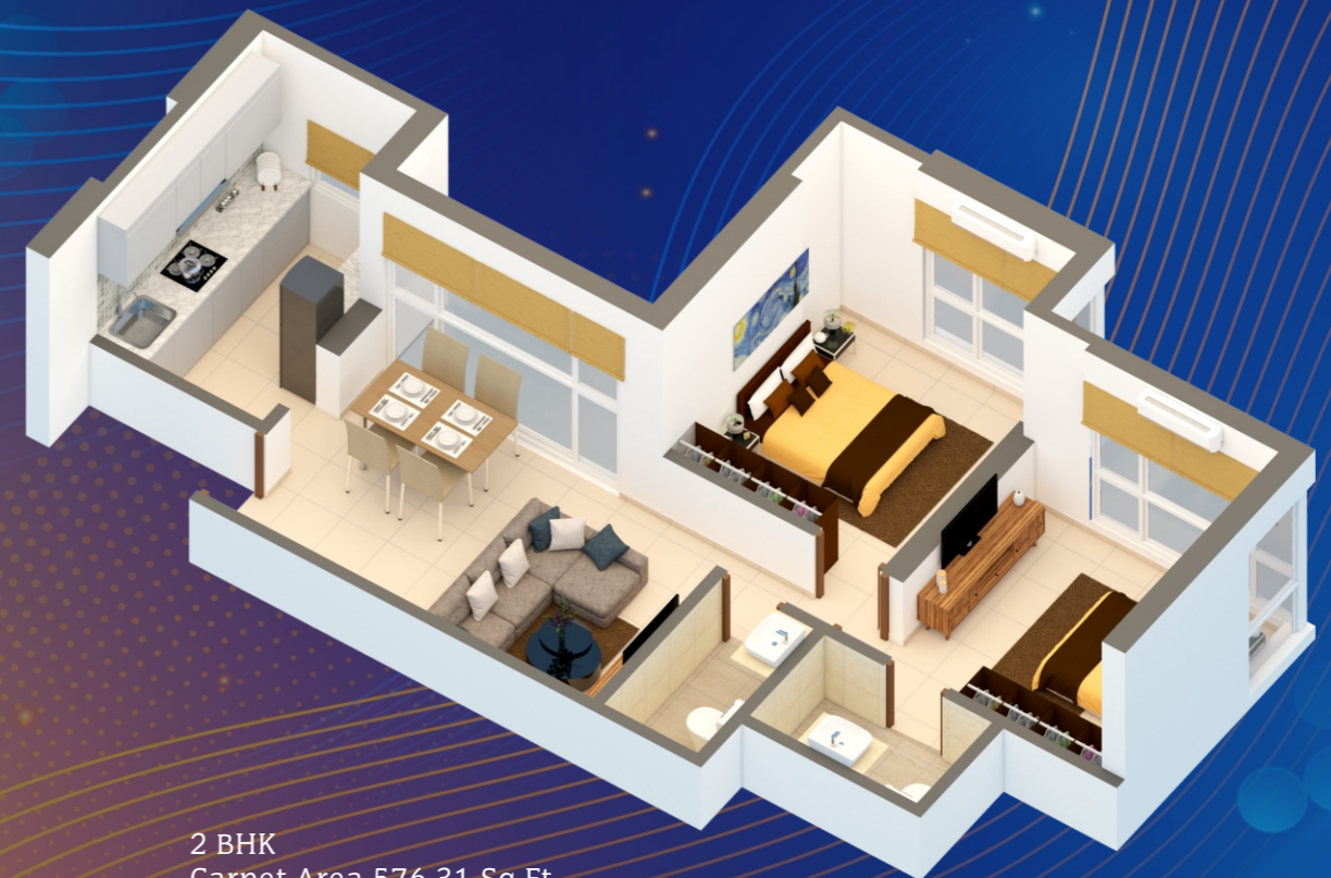
2 BHK Carpet Area 576.31 Sq.Ft.