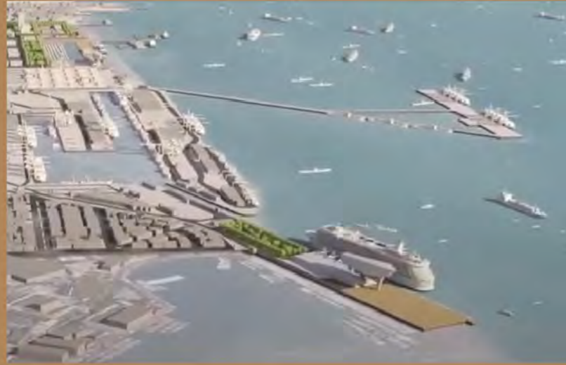
International Cruise Terminal (ICT) (Ballard Pier)

With all the new infrastructure, you'll have access to what you know and what is to come. Byculla is poised to be at the heart of all new developments. What better way to stay connected to it all?