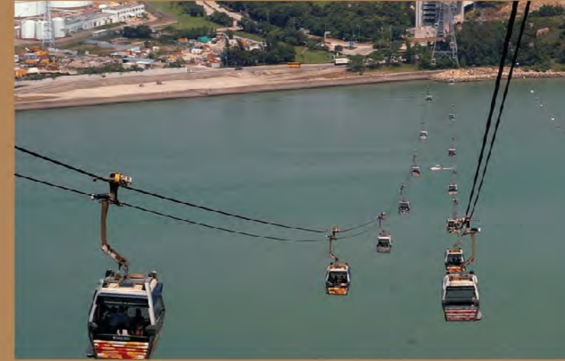
Ropeway (Sewri to Elephanta caves)