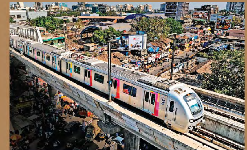
Mumbai Metro 11 (Wadala to CSMT)