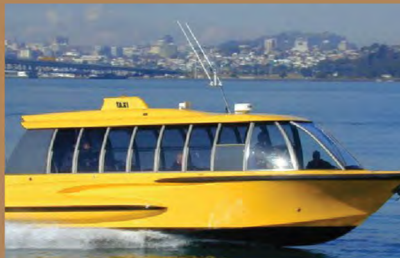
Water Taxi (Bhaucha Dhakka to Belapur, Dharamtar, Rewas & JNPT)