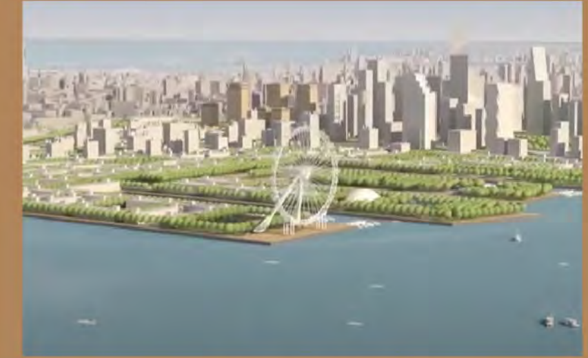
Mumbai Eye (Mazgaon Dock)