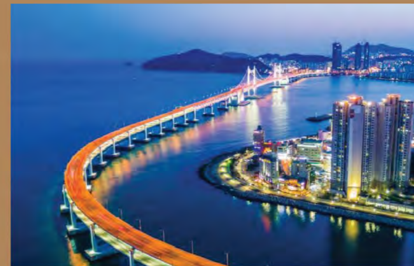
Mumbai Trans Harbour Link (Sewri to Nhava Sheva)