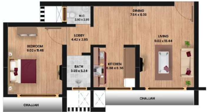
■ 1 BHK (415 SQ FT)