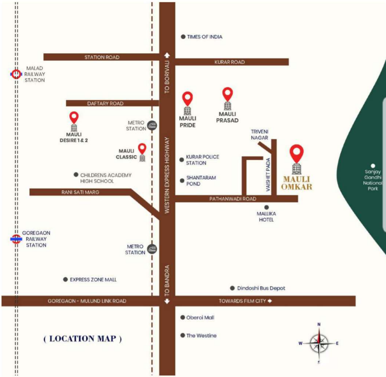
( LOCATION MAP )