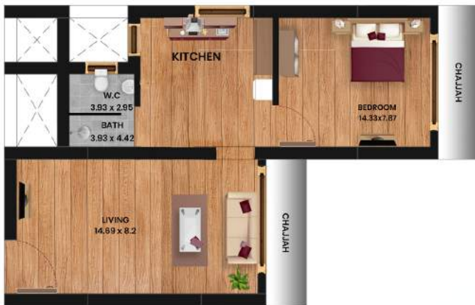
1 BHK (290 SQ FT)