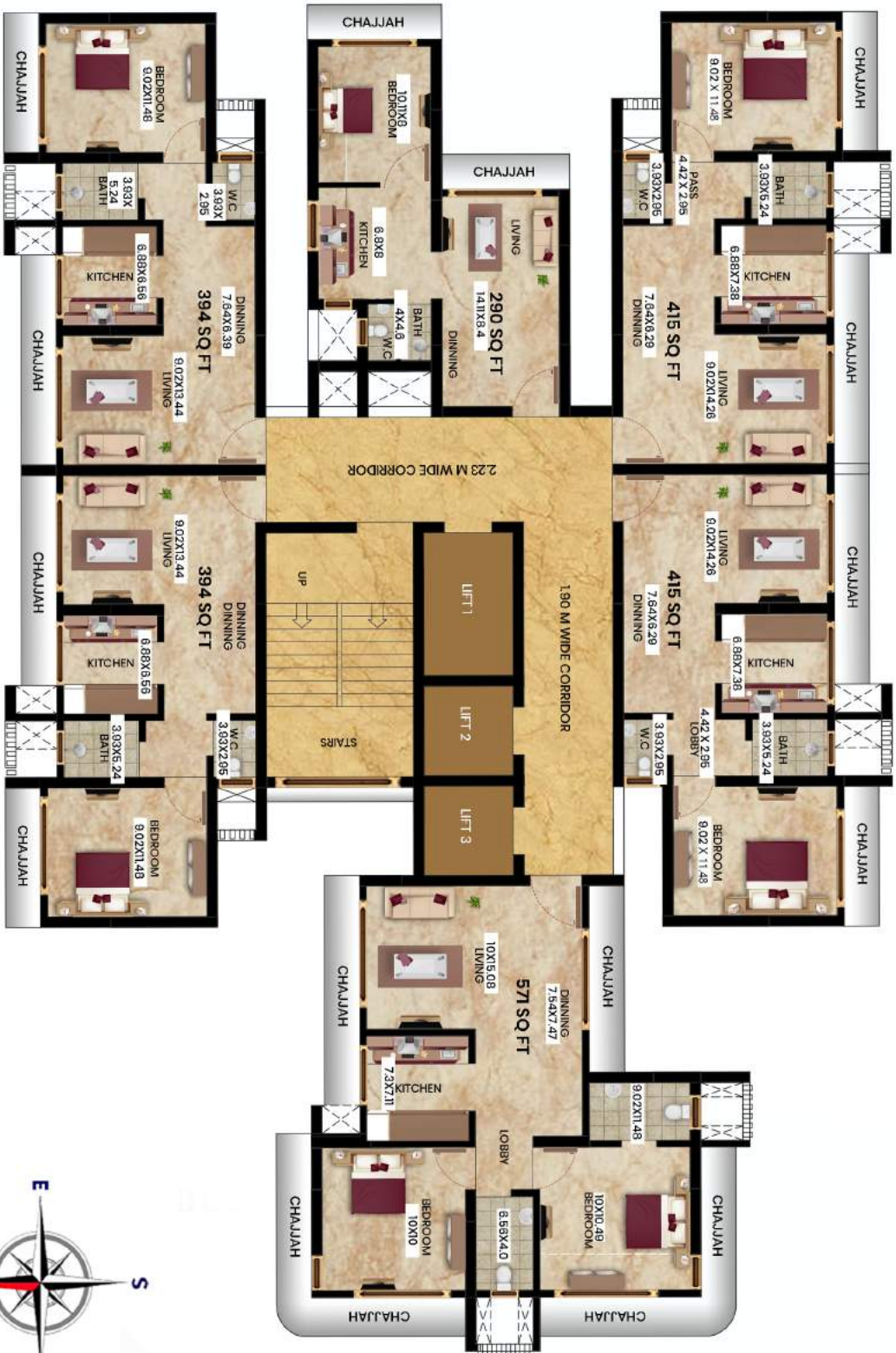
TYPICAL FLOOR PLAN BLDG. 2B