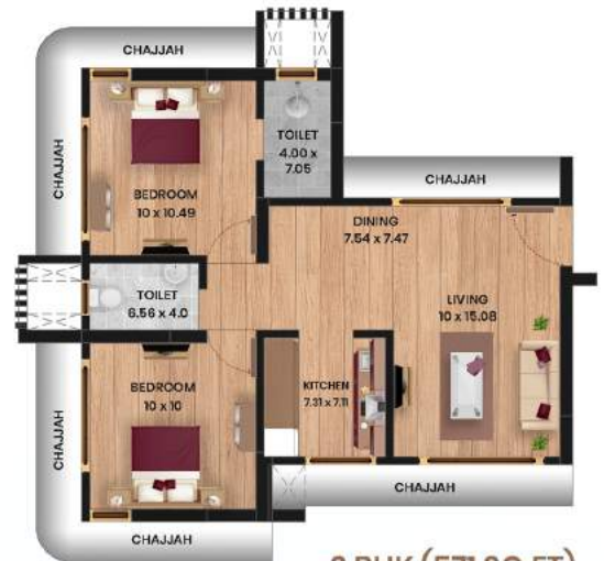
2 BHK (571 SQ FT)