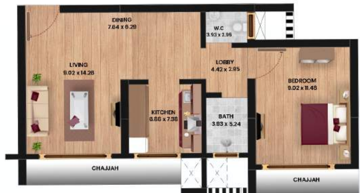
■ 1 BHK (394 SQ FT)