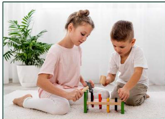
Children Play Area