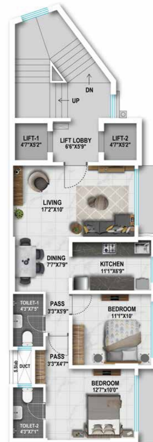
Typical floor plan