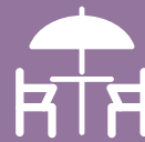
Open Air Garden

The plush residences here have been thoughtfully designed, along with rooftop amenities to offer a variety of options for recreation and relaxation ensuring every moment you spend here is a moment like no other. The rooftop amenities here, offer you an ensemble of recreational activities along with the opportunity to interact with like-minded people.