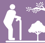
Senior Citizens Corner