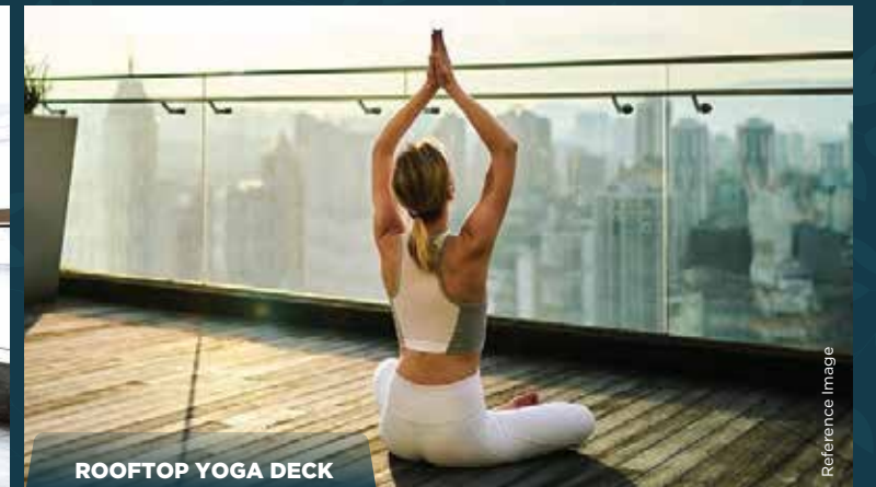
ROOFTOP YOGA DECK