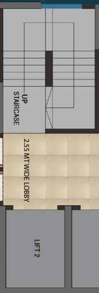
Typical Floor plan (1 st to 20 th )