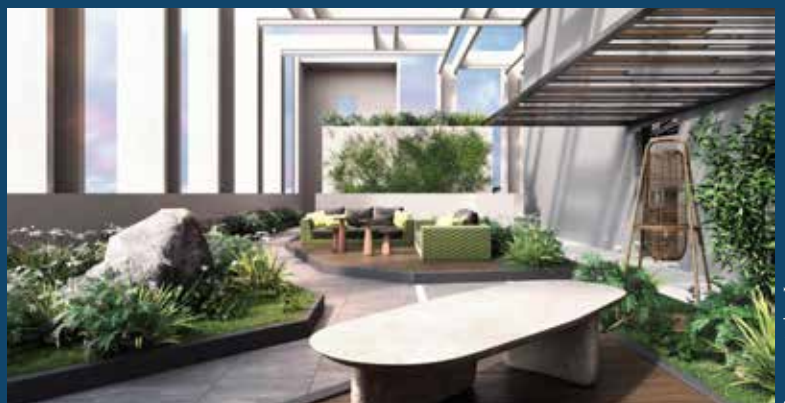
The Rooftop Zen Garden