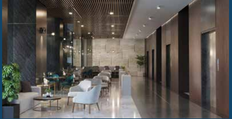
Library + Coffee Shop + Meeting Pods