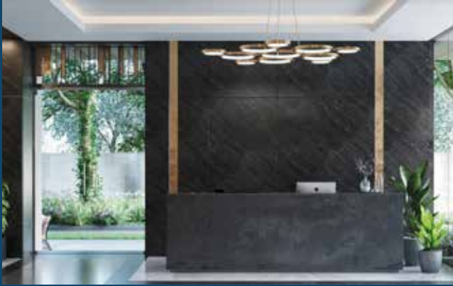
Grand Entrance Lobby