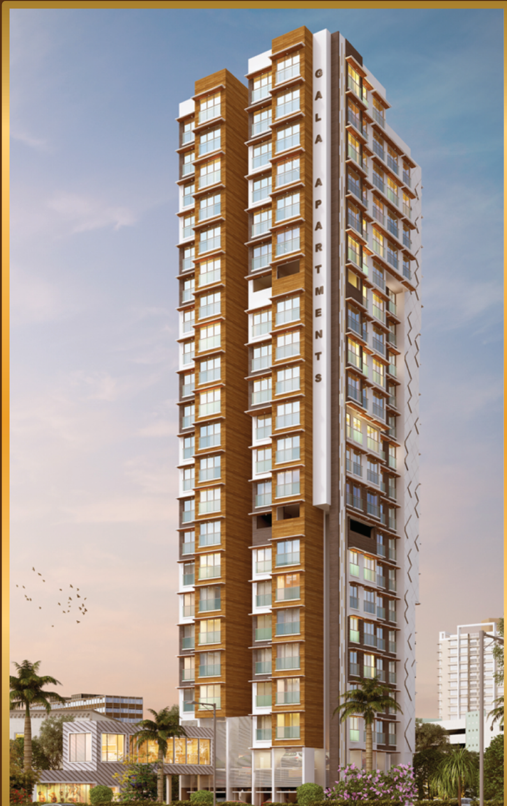
Gala, Jitendra Road , Malad (E) , Mumbai - 97