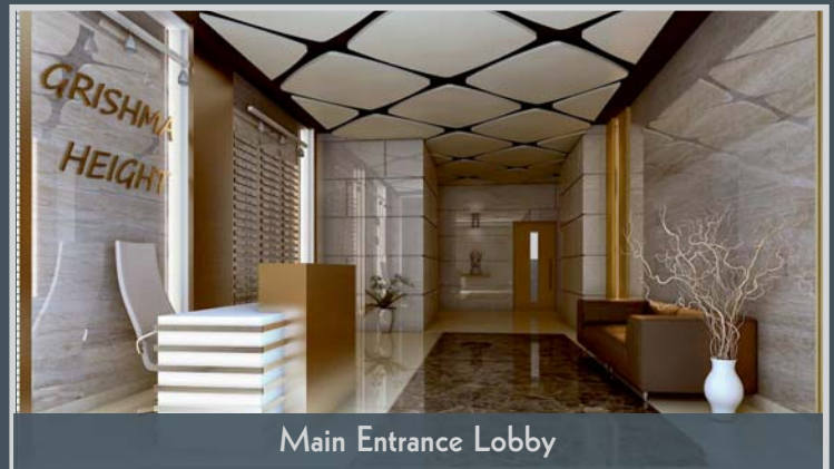
Main Entrance Lobby