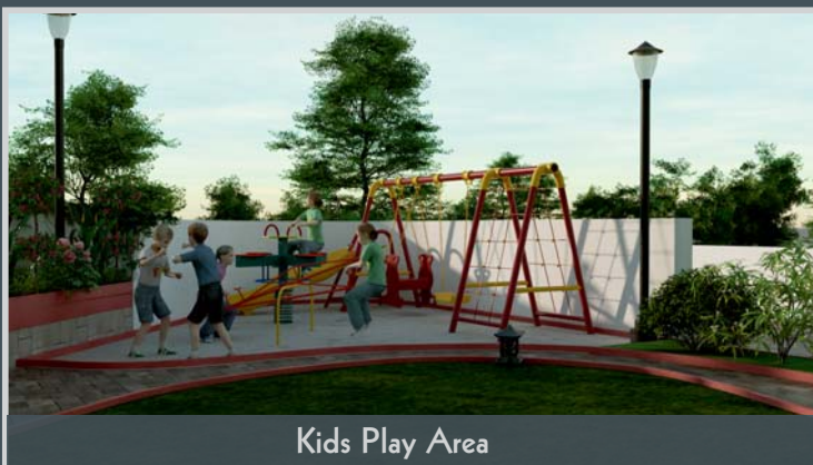
Kids Play Area