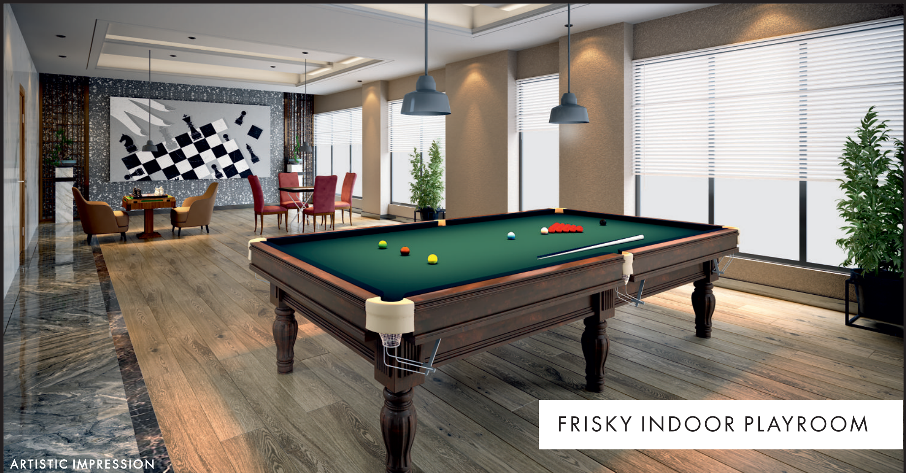
FRISKY INDOOR PLAYROOM