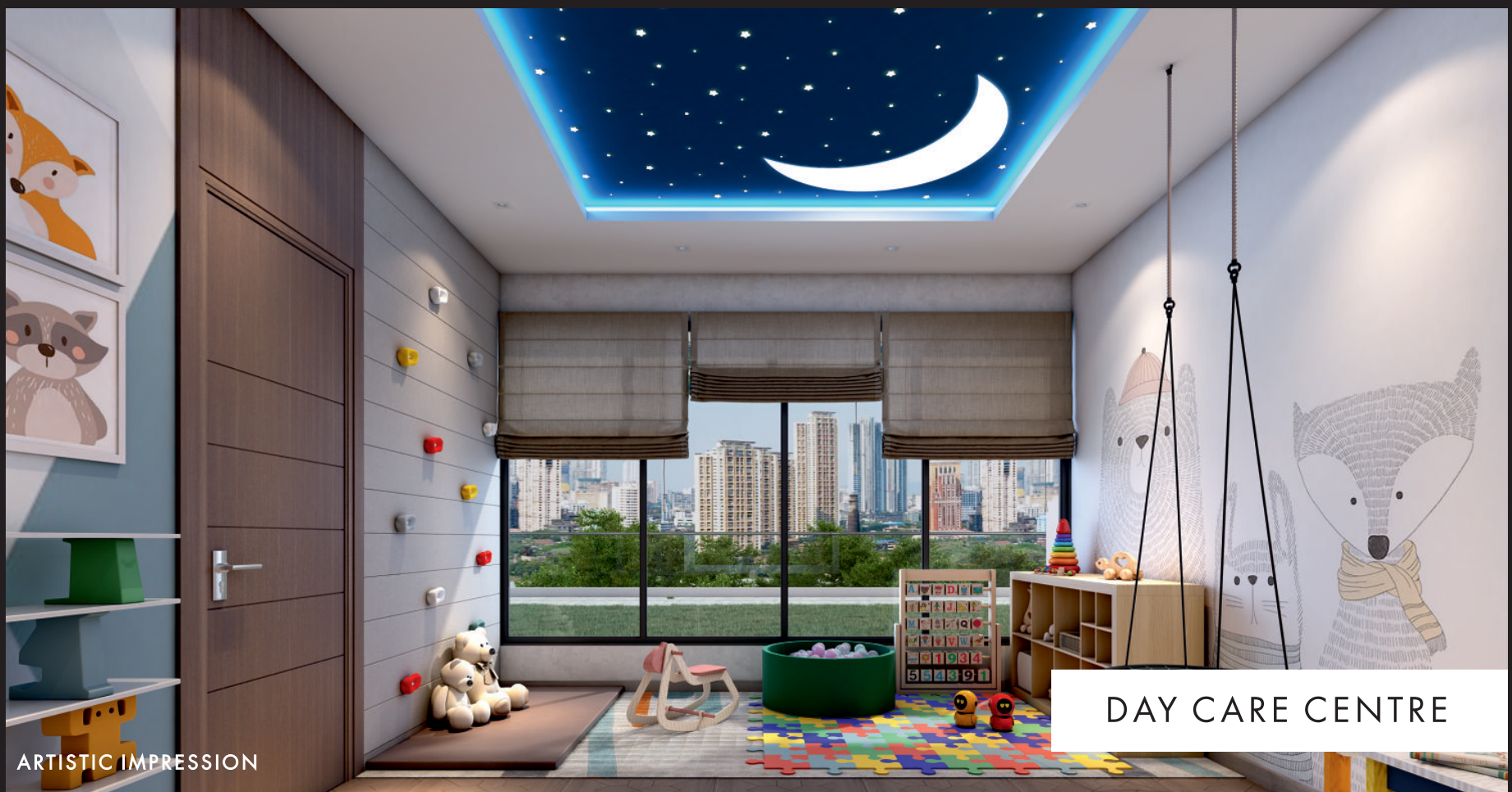
DAY CARE CENTRE