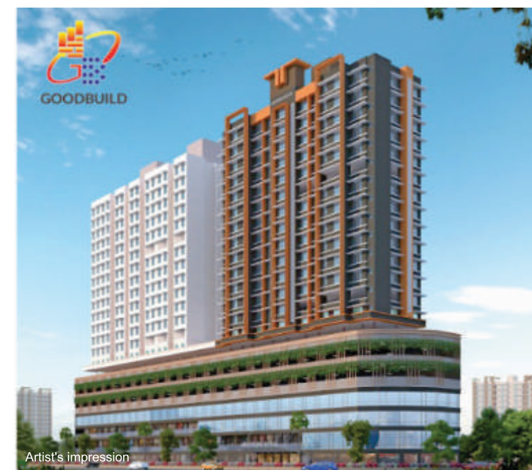
SHEPHERD ROYAL GOREGAON WEST

Goodbuild has an ability to complete their projects most satisfactorily manner under all adverse circumstances. Company is professionally managed by a team of qualified and dedicated professionals and managers who have a vast experience in the area of Architecture Design and Service Consultancy.