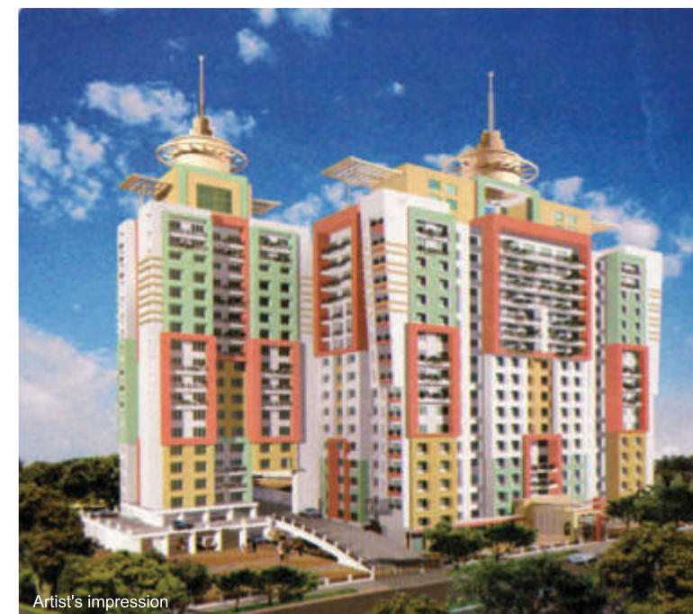
SHEPHERD RESIDENCY GOREGAON WEST