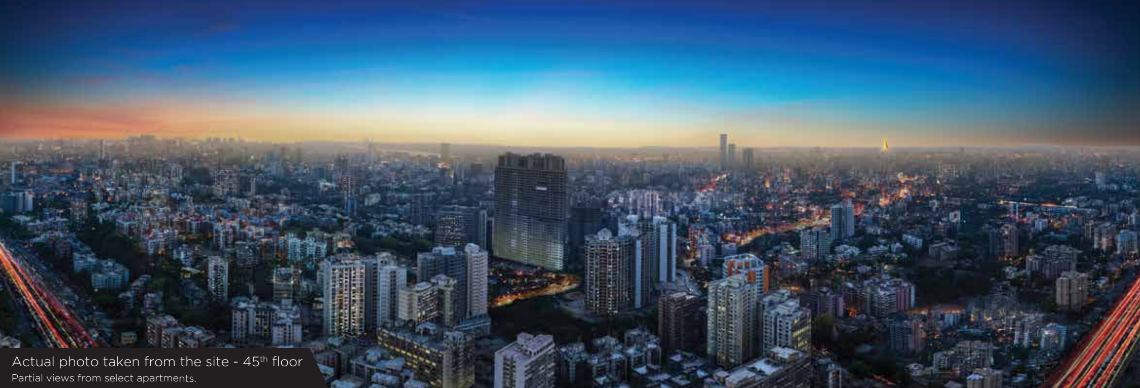
Actual photo taken from the site - 45 th floor Partial views from select apartments.