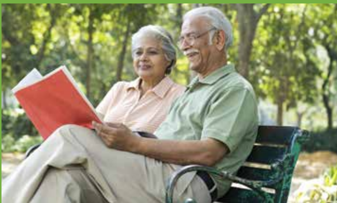
Senior Citizen's Garden Area