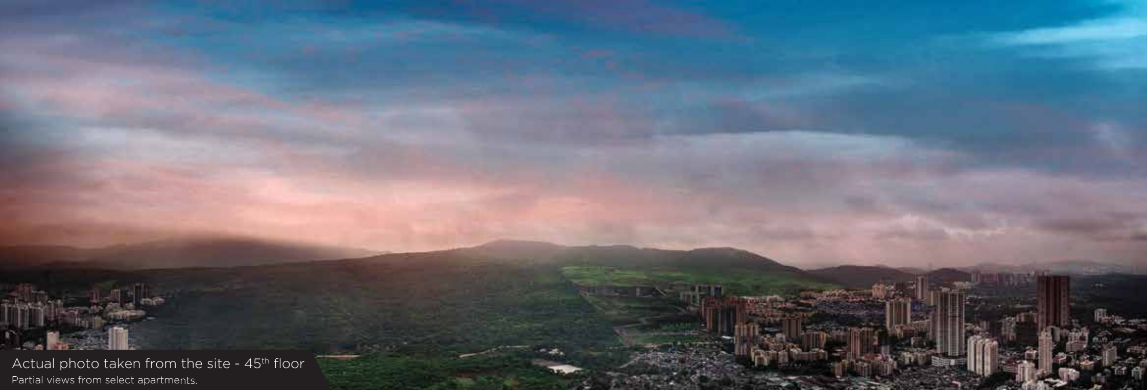
Actual photo taken from the site - 45 th floor Partial views from select apartments.