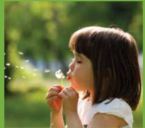
Open to air Children's Play Area