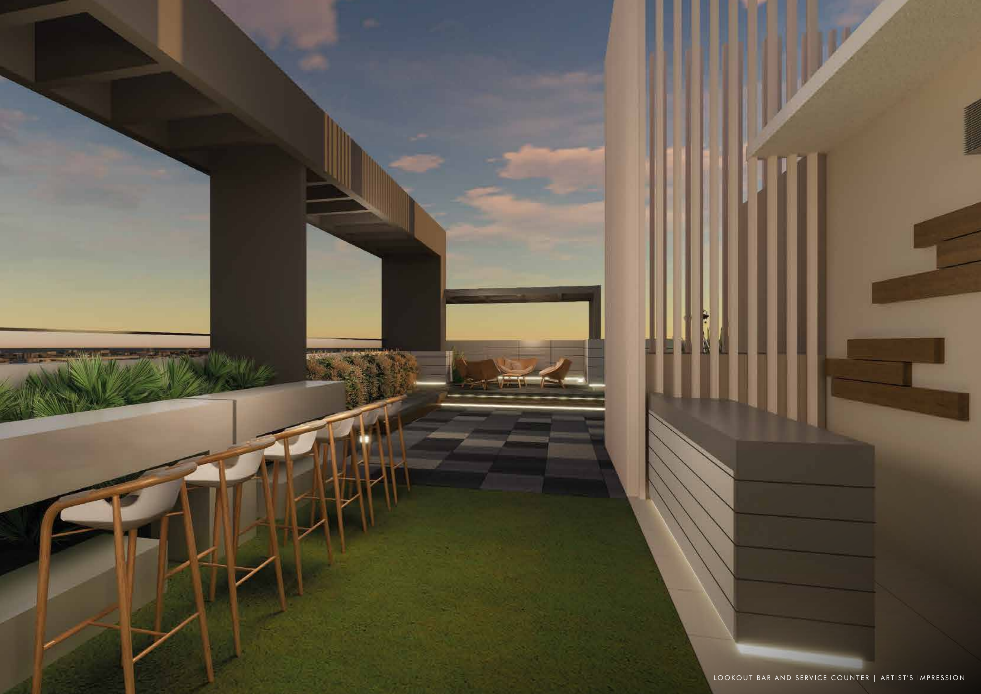
LOOKOUT BAR AND SERVICE COUNTER | ARTIST'S IMPRESSION