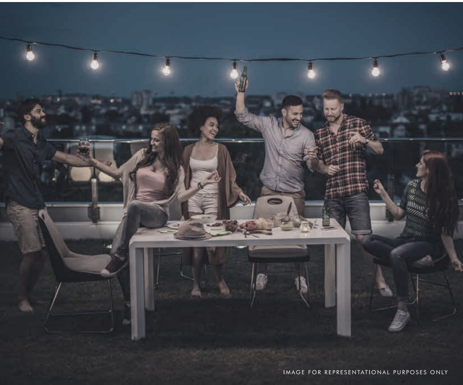
IMAGE FOR REPRESENTATIONAL PURPOSES ONLY

Sometimes, all you need to turn neighbours into friends, every get-together into a celebration and time with family into precious memories is the right venue. At Rustomjee Erika, you can find the perfect one for every occasion. Go ahead, pick the one that makes friendships and moments last.