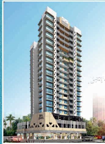
SEA JEWEL MALAD (EAST)