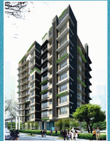
SHIVOTHAM HEIGHTS GOREGAON (WEST)