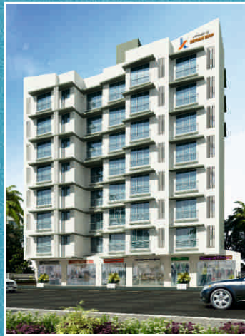
GAYATRI CHSL BORIVALI (WEST)