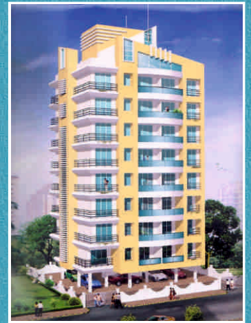
CHRISTMARIA CHSL BORIVALI (WEST)