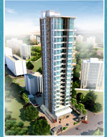
NAKSHATRA CHSL BORIVALI (WEST)