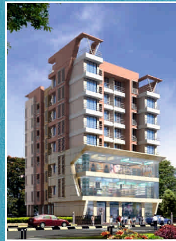
VISHNU CHSL BORIVALI (WEST)