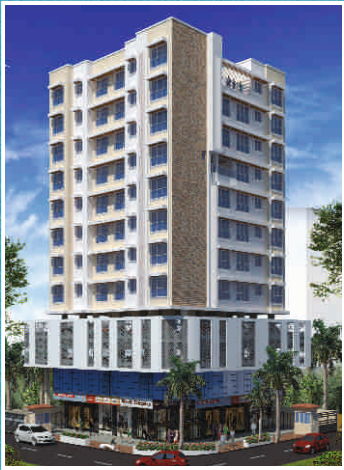
TRINITY BORIVALI (WEST)