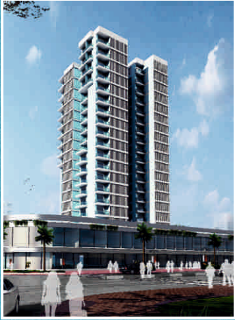
LAXMI CHHAYA BORIVALI (WEST)