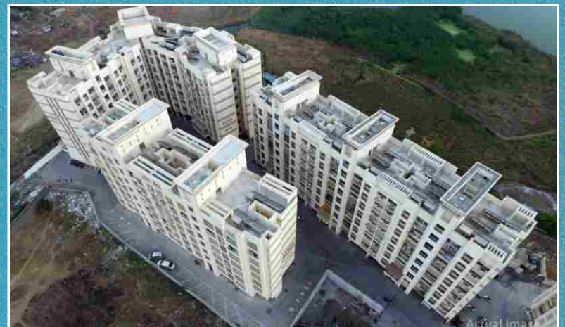
RAJHANS SEASONS VASAI (WEST)