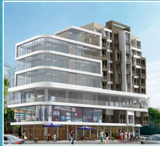
RAMKRISHNA CHSL BORIVALI (WEST)