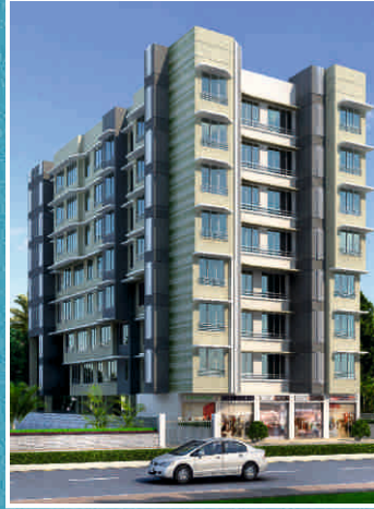
LAKSH LABH CHSL BORIVALI (EAST)