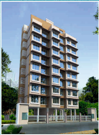
OM SHREE MANGESH CHSL BORIVALI (WEST)