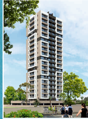
MORYA HEIGHTS BORIVALI (WEST)