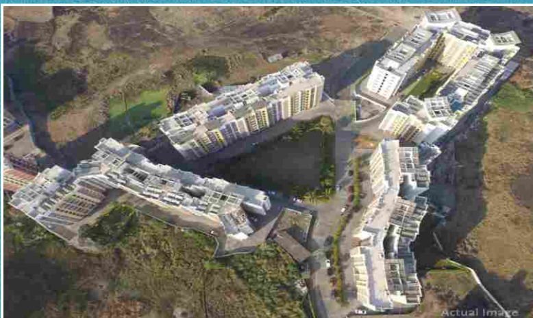
RAJHANS KSHITIJ VASAI (WEST)