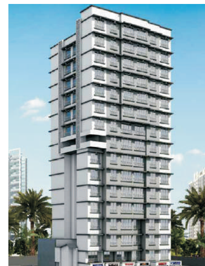
Dipti Surya CHS Ltd. Jogeshwari (E)