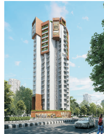
Dipti Royal Arc Shivaji Park, Dadar (W)