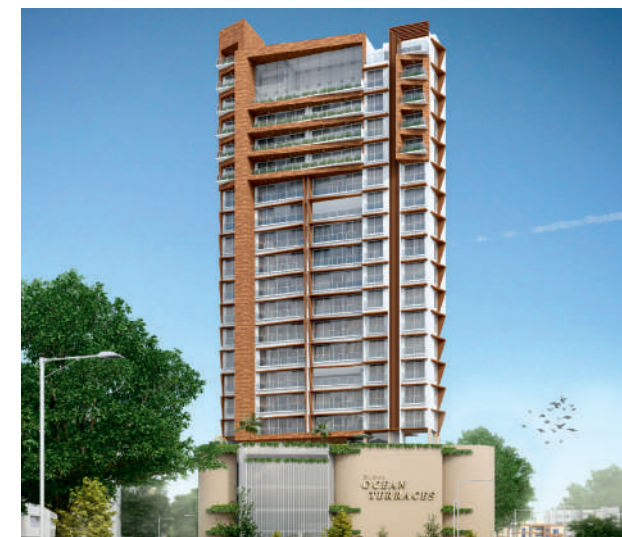
Dipti Ocean Terraces Shivaji Park, Dadar (W)