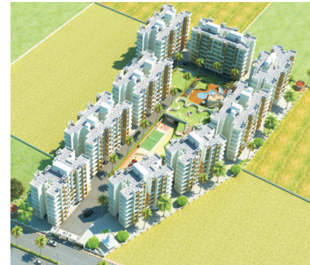
Dipti Sky City Ambarnath (E)