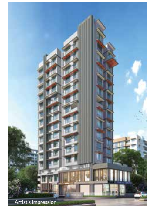
RISHABRAJ SURAJ - Borivali W MahaRera No. P51800029277