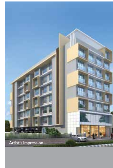
RISHABRAJ ASHISH - Borivali W MahaRera No. P51800007607