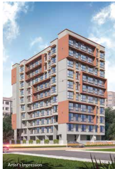
RISHABRAJ PRIDE - Dahisar W MahaRera No. P51800031144