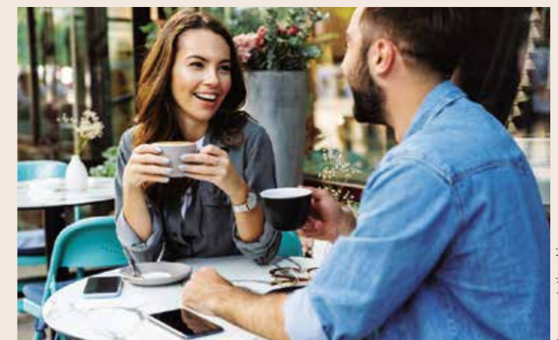
◆— CAFÉ —◆