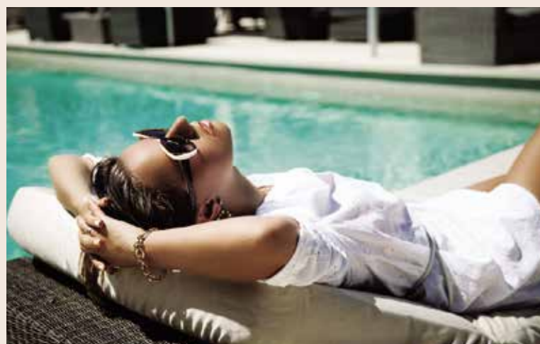
◆— SUNDECK —◆