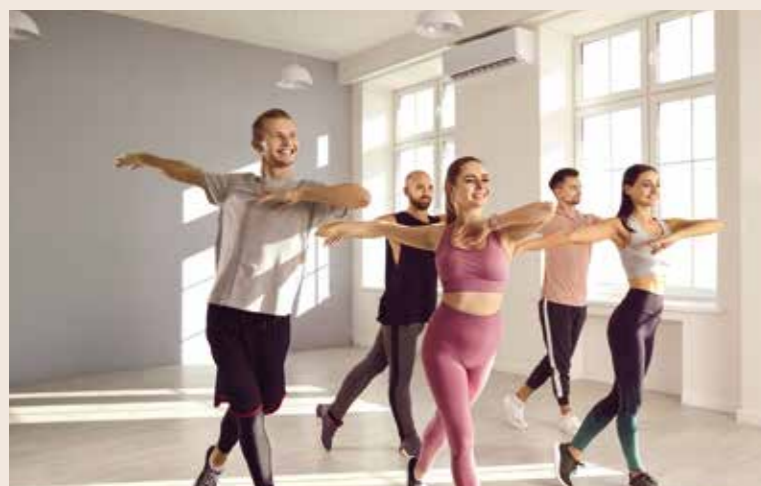
◆— DANCE & AEROBICS STUDIO —◆