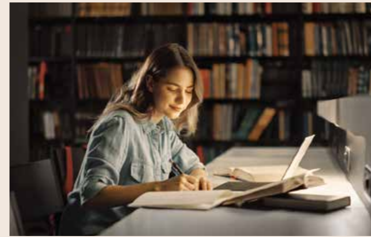
◆— LIBRARY —◆

An exclusive clubhouse only for residents of Siesta is the best place to spend time with family and friends or bond with residents.