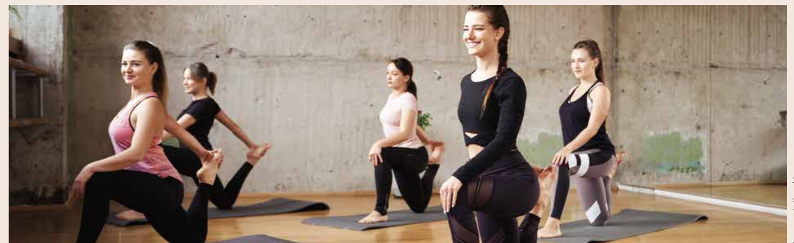
◆— YOGA & MEDITATION ZONE —◆