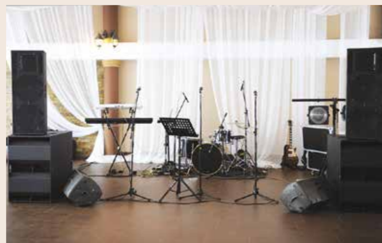
◆— MULTI-PURPOSE MUSIC STUDIO —◆