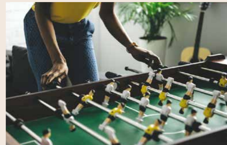
◆— INDOOR GAMES AREA —◆