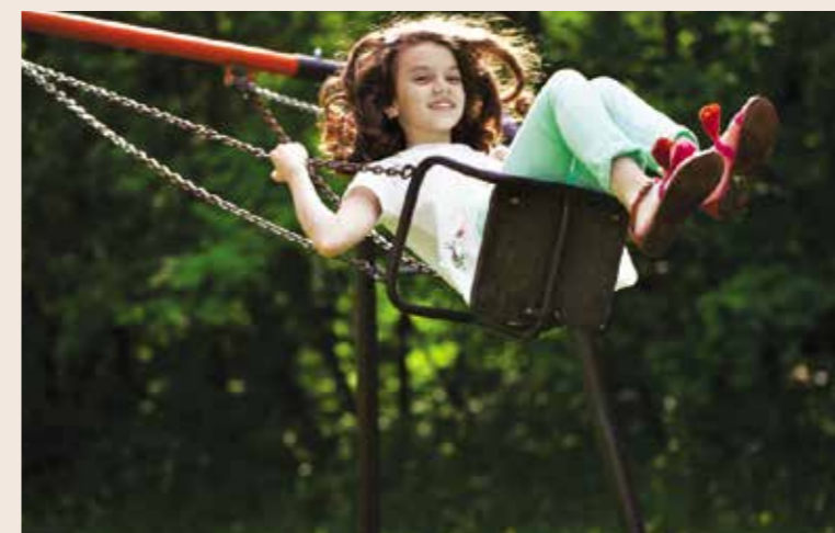
◆— KIDS PLAY AREA —◆