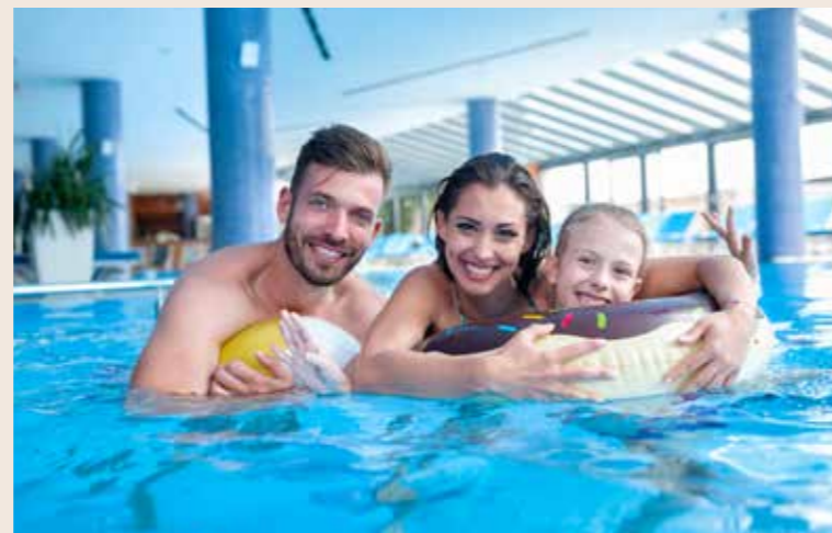
◆— TEMPERATURE CONTROLLED INDOOR POOL —◆