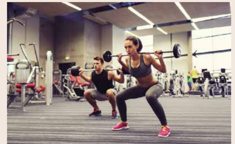
◆— GYMNASIUM —◆