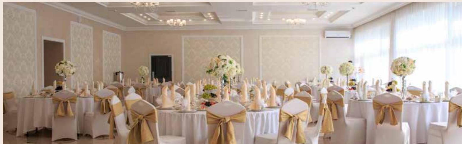
◆— BANQUET HALL —◆

A Double Height Cafeteria on the 10 th & 11th floor overlooks panoramic views of the swimming pool and landscaped garden. The two floors also host over 25 curated luxury amenities that provide for each member of the family.