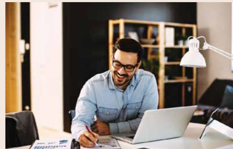
◆— BUSINESS LOUNGE —◆