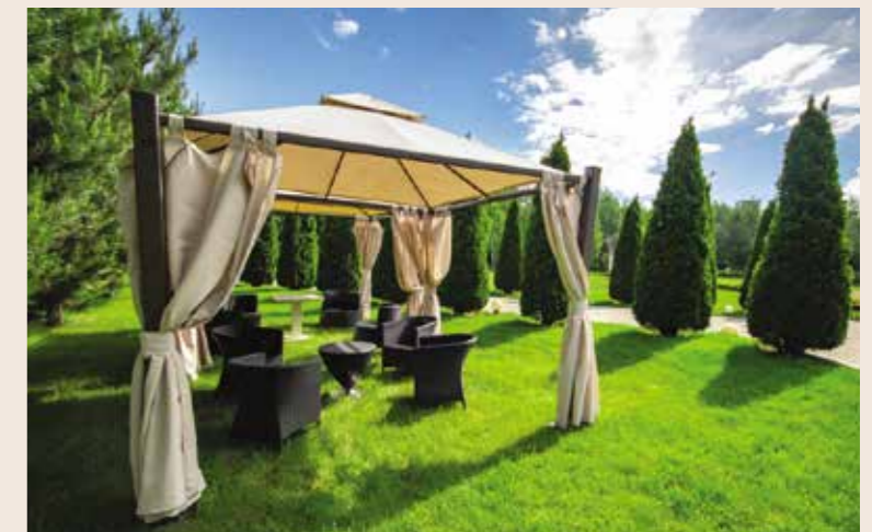
◆— GARDEN WITH CABANAS —◆