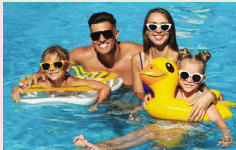
◆— ADULT & KIDS SWIMMING POOL —◆