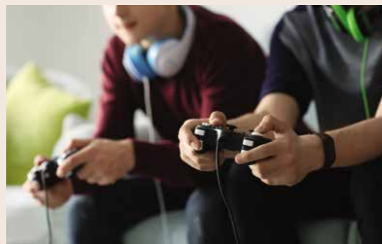
◆— DIGITAL GAME ARCADE —◆