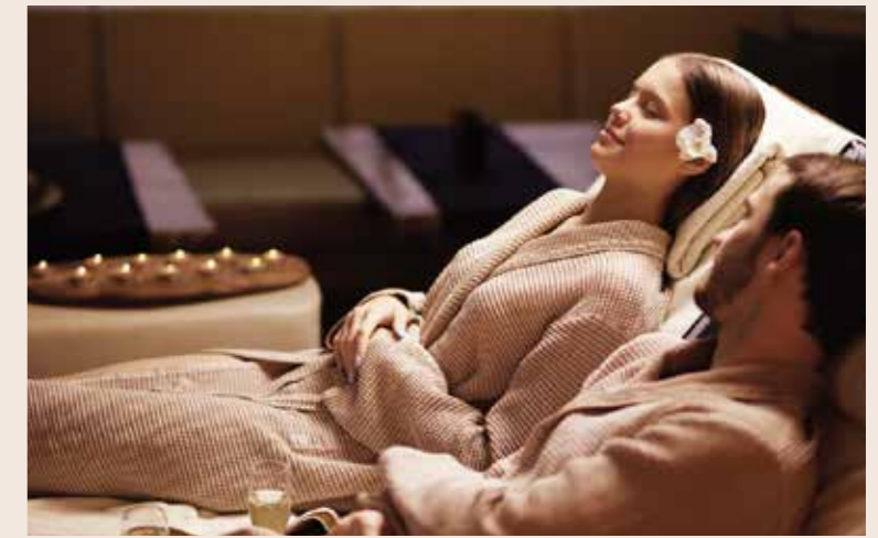
◆— SPA —◆