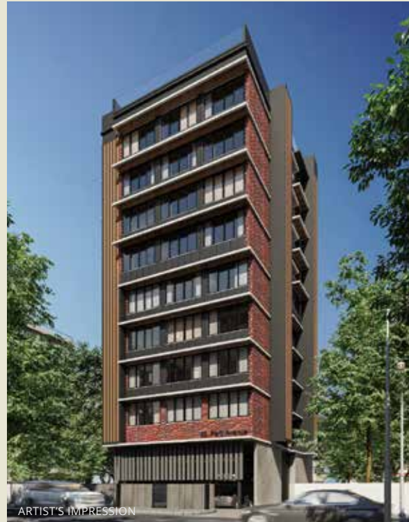
52 PARK AVENUE - Khar W MahaRera No. P51800032136