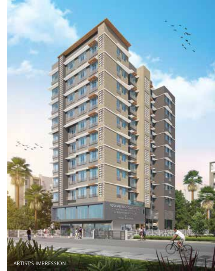
RISHABRAJ CLASSIC - Malad E MahaRera No. P51800027149