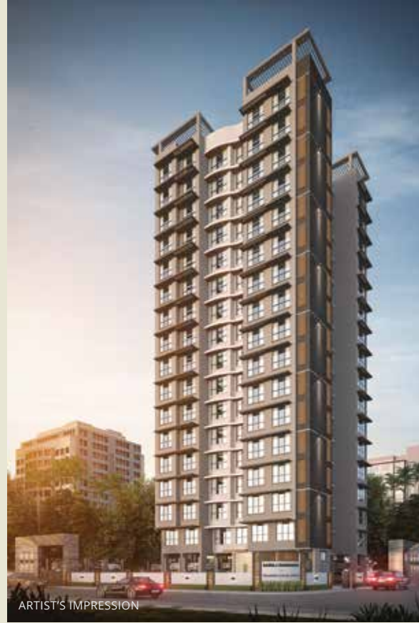
RISHABRAJ SAMAJ DARSHAN - Kandivali W MahaRera No. P51800010479