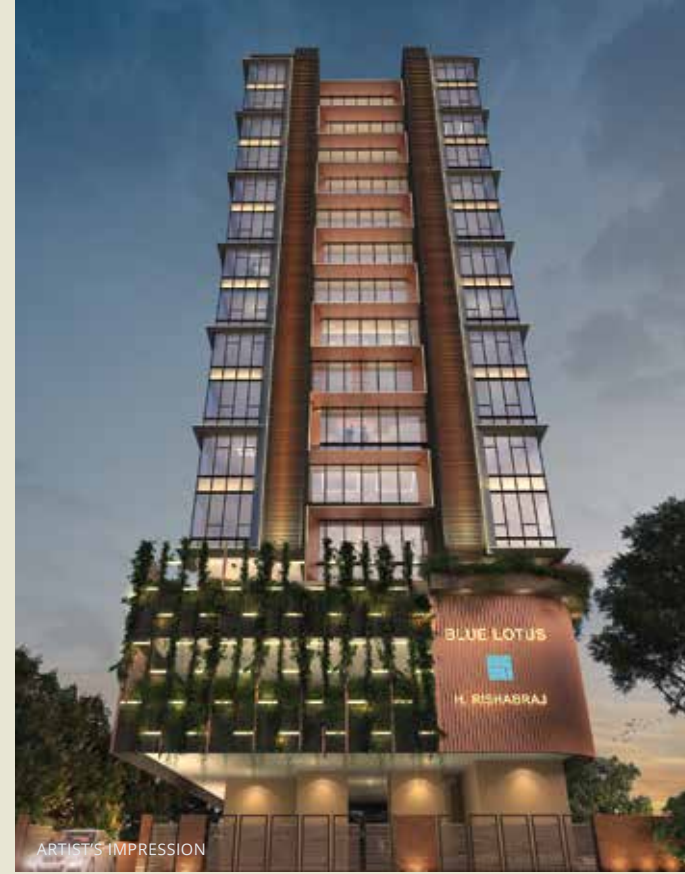
BLUE LOTUS - Khar W MahaRera No. P51800033826