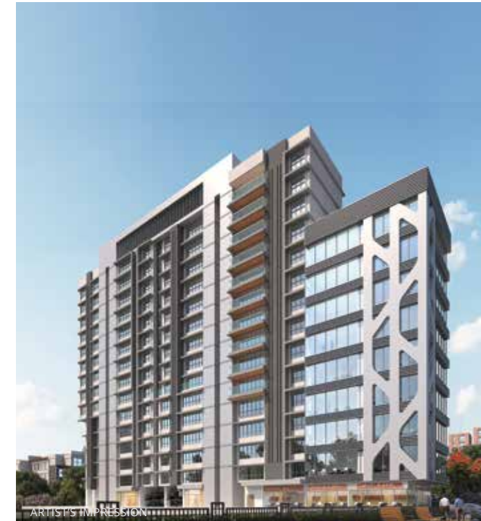
RISHABRAJ VATSAL - Kandivali W MahaRera No.