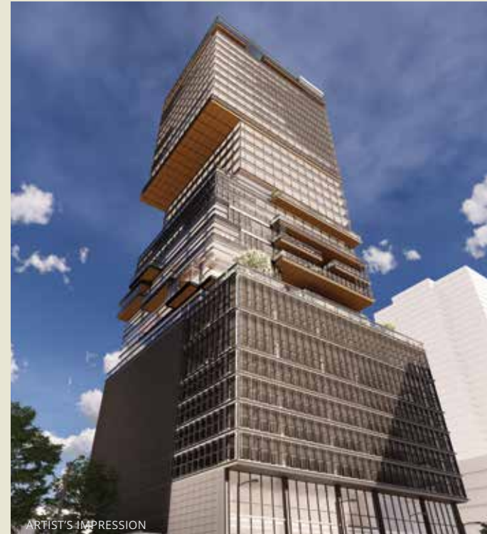
63 GOLD MEDAL AVENUE - Goregaon W MahaRera No. P51800027330