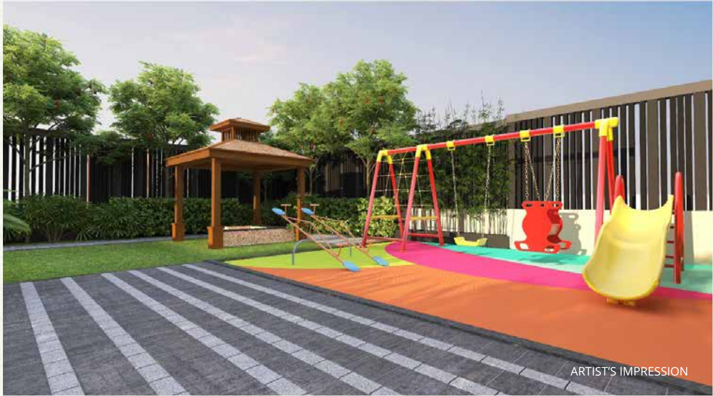
Kid's Play Area & Sitouts

A crowning glory of the project is the brilliantly topped lively terrace garden and spectacular terrace turf interspersed with a delightful children's play area and relaxing sit-out avenues. The terrace garden at Parkvistas is a calm, vibrant oasis of unlimited peace and happiness in the midst of a hustling city. Set against the panoramic views of a pulsating city landscape, it also forms the perfect backdrop for evenings full of wholesome fun, laughter and smiles for you and your loved ones.