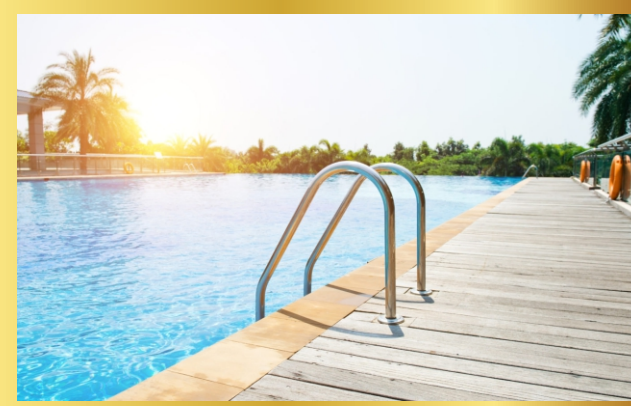
Rooftop Plunge Pool