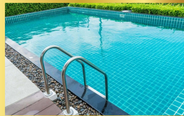
Podium Swimming Pool