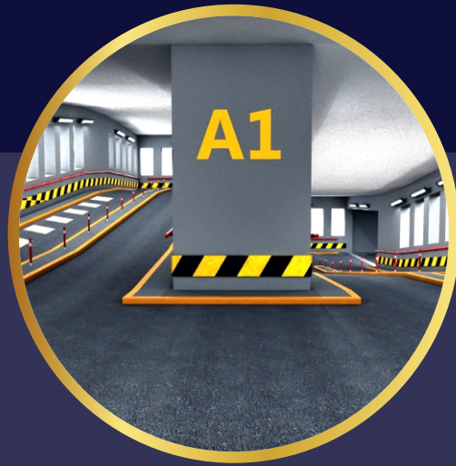
Ramp Access for Parking