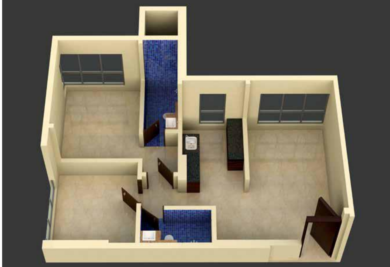
As per approved plans.