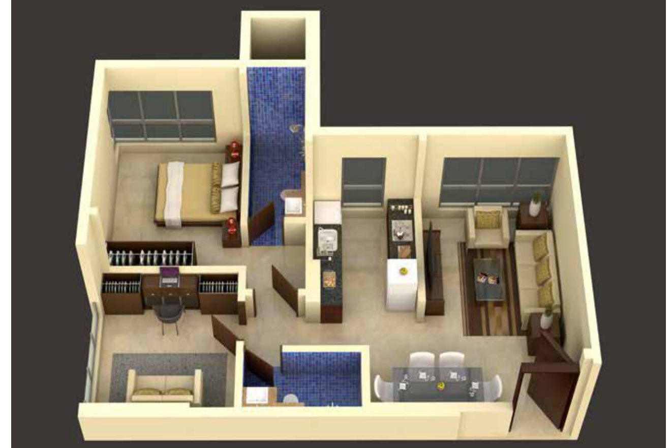
Interior & Furniture as proposed by space design at the cost of allottees