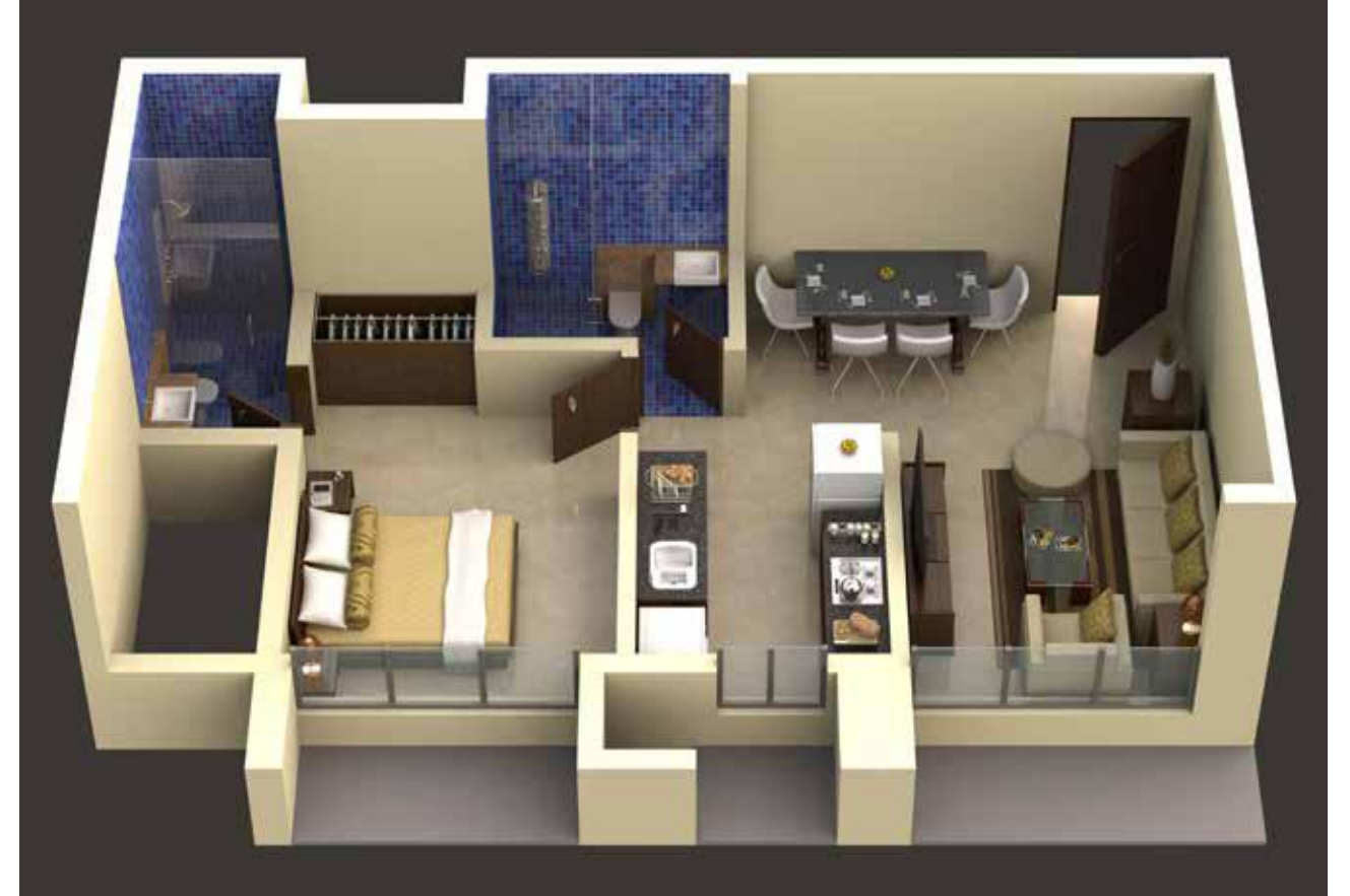
Interior & Furniture as proposed by space design at the cost of allottees