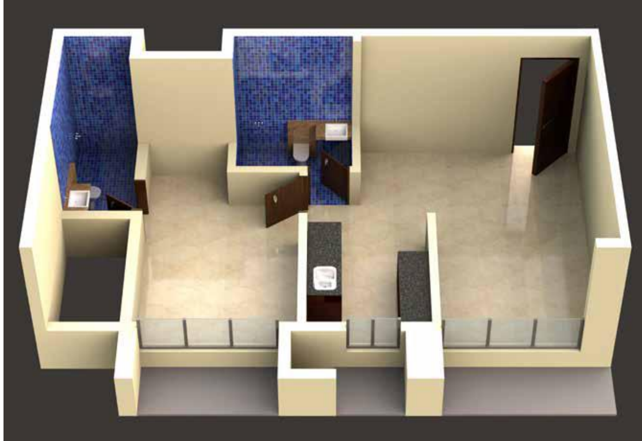
As per approved plans.