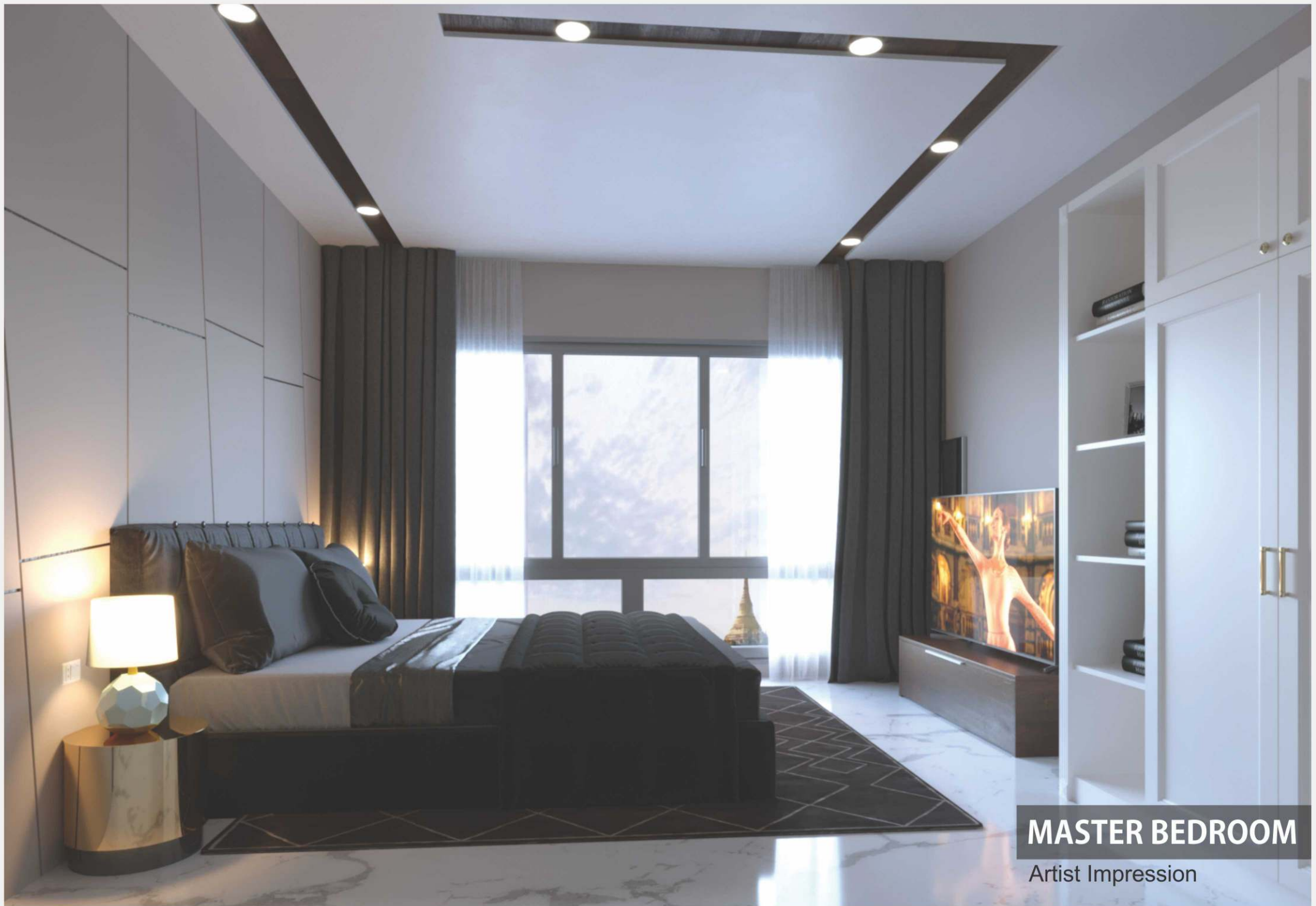
MASTER BEDROOM Artist Impression