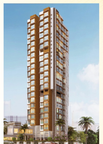
GALA Malad (E)