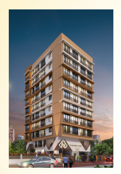
212 Apartment Goregaon (W)