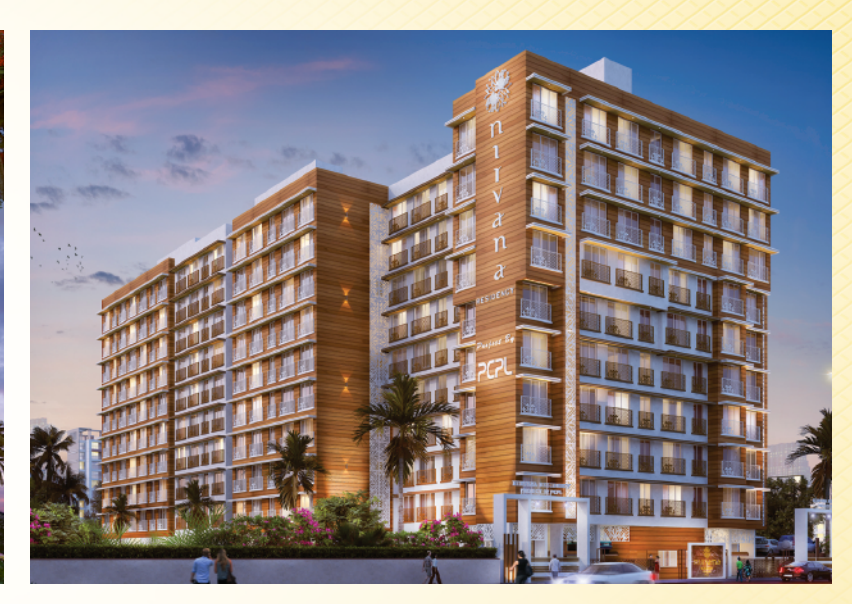
NIRVANA Malad (W)