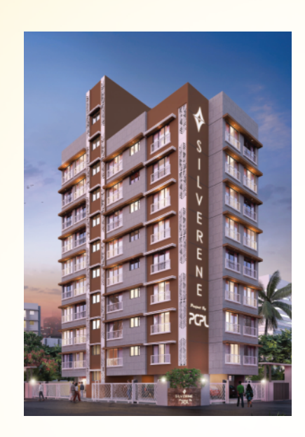
SILVERENE Malad (W)

A pioneer in the space of affordable luxury homes, PCPL has successfully developed and delivered over 3,00,000 sq.ft of top-quality residential and commercial properties. PCPL don't just build homes, they build memories with several such loving homes have become their legacy.