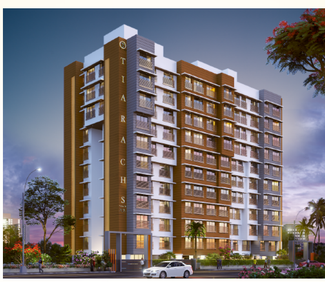
TIARA Malad (W)