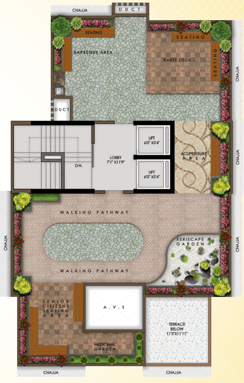
Ground Floor Plan Terrace Floor Plan