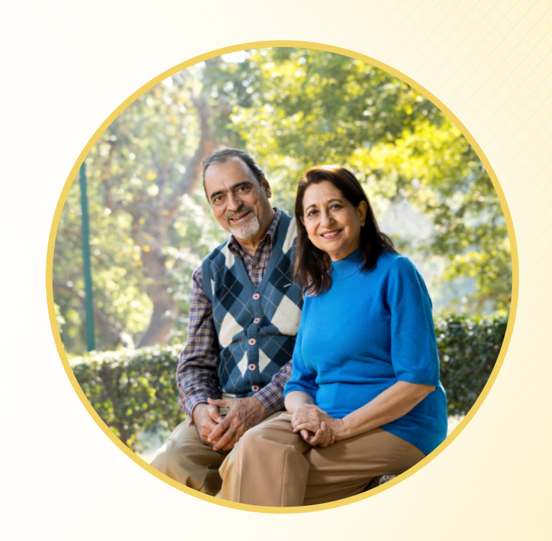
Senior Citizen Seating Area