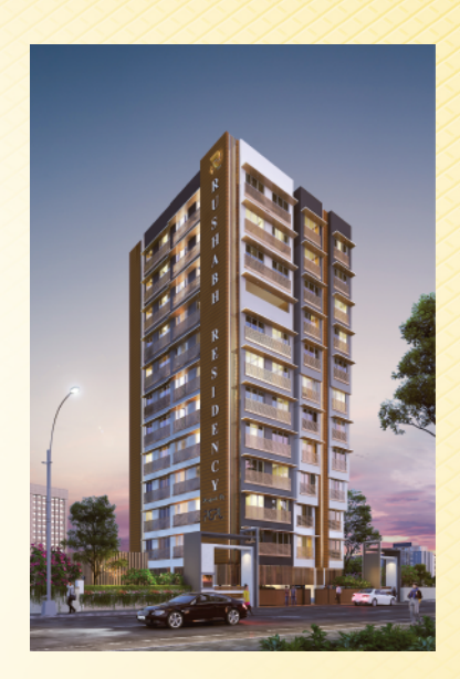
RUSHABH RESIDENCY Malad (E)