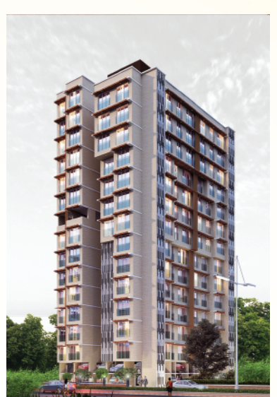
SPARSH Malad (W)