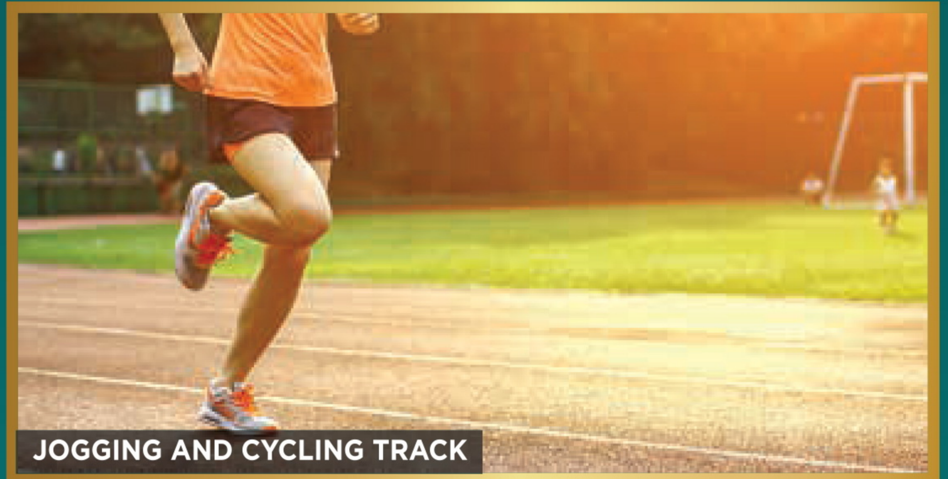
JOGGING AND CYCLING TRACK