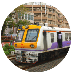
Rail Connectivity Ram Mandir Station Just 2 mins