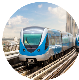
Metro Connectivity Upcoming Metro Station Just 3 mins