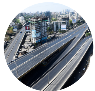
Road Connectivity WEH or SV Road Just 2 mins