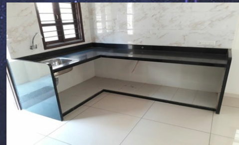
Polished Granite Platform