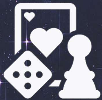
Indoor Games Room