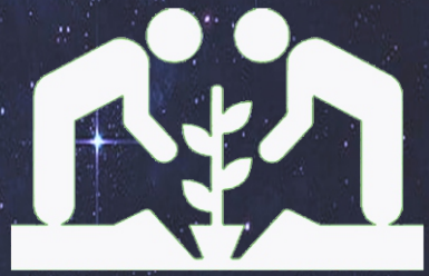
Roof Top Garden