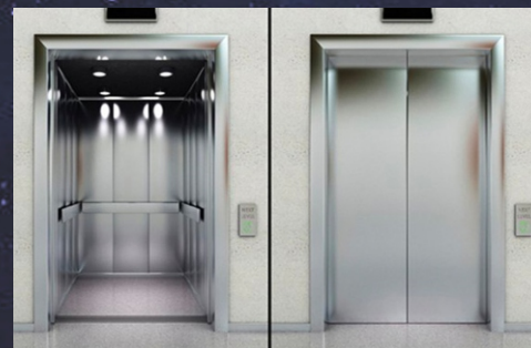
High Speed Elevators