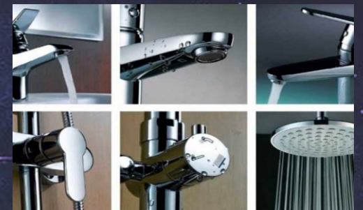
High end Sanitary Fittings