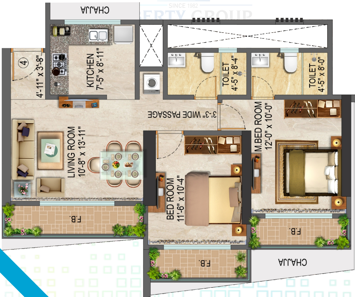
2 - BHK Rera C.A. 744 Sq.ft