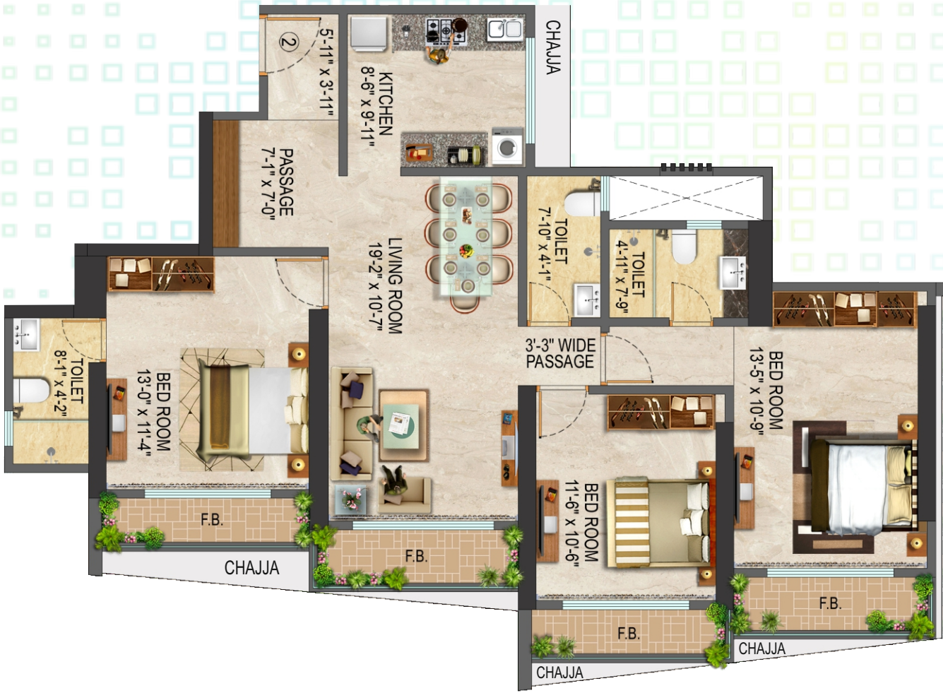
3 - BHK Rera C.A. 1150 Sq.ft