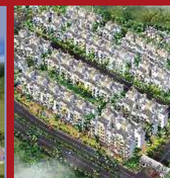
Sanghvi Paradise (Asangaon)