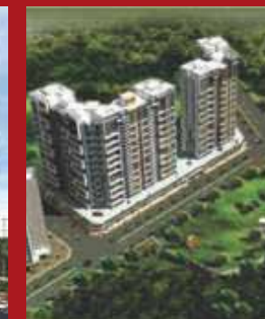
Sanghvi Ecocity Dahisar