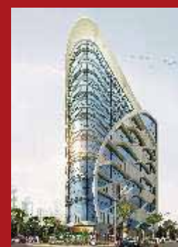
Sanghvi Jewel (Malad)