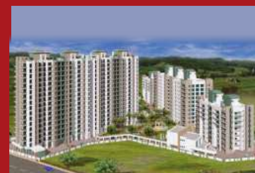
Sanghvi Valley (Kalwa)