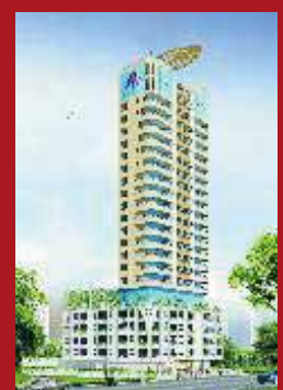
Sanghvi Galaxy (Girgaon)