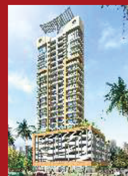
Mohankheda Heights (Mazgaon)