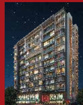
Sanghvi One Ghatkopar (W)