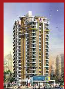
Sanghvi Exotica (Dahisar)