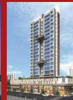
Sanghvi Solitaire Borivali (E)