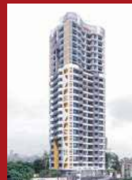
Sanghvi Heights Wadala (E)