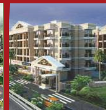
Sanghvi Golden City (Atgaon)