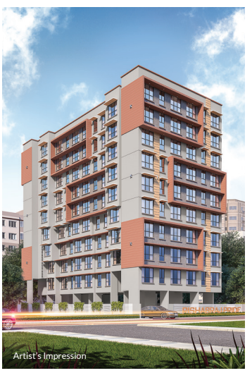
RISHABRAJ PRIDE - Dahisar W