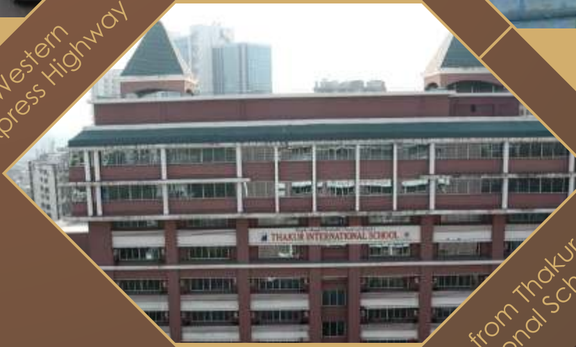
10 Min from Thakur International School