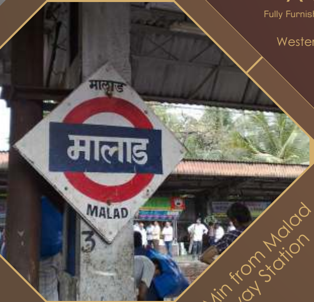
5 Min from Malad Railway Station