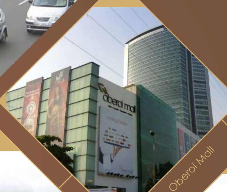
10 Min from Oberoi Mall