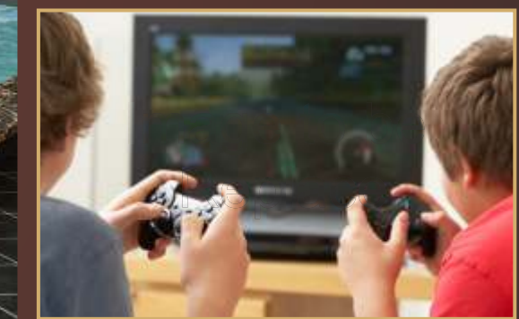
DIGITAL PLAY ZONE