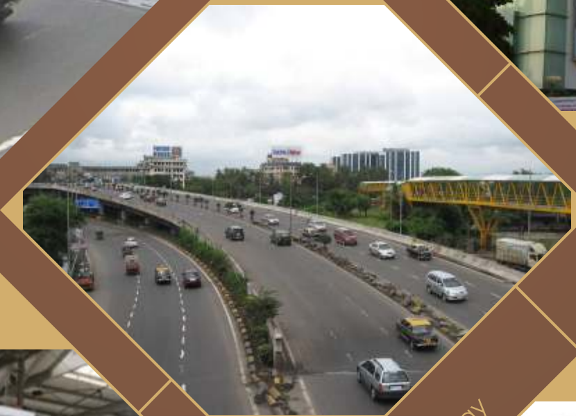
On Western Express Highway