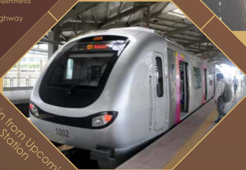
1 Min from Upcoming Metro Station