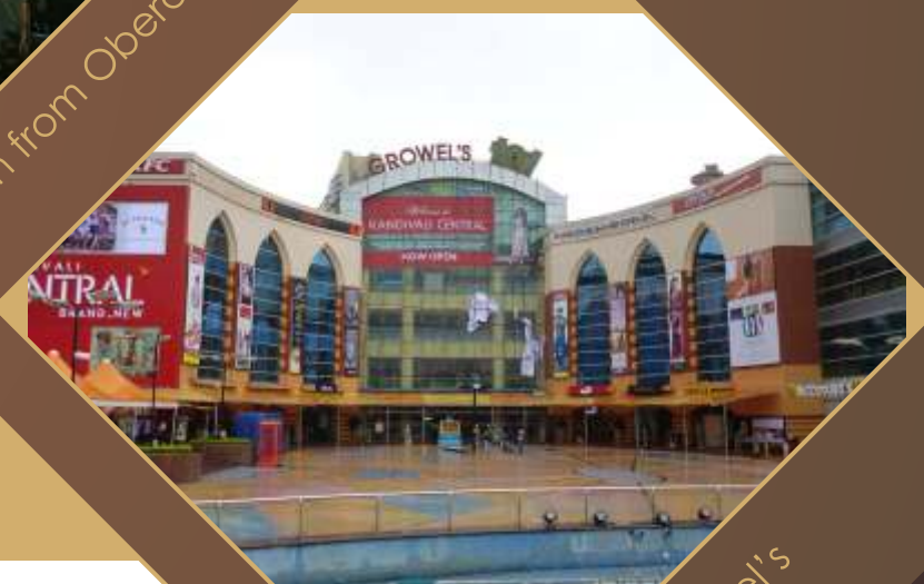
5 Min from Growel's 101 Mall