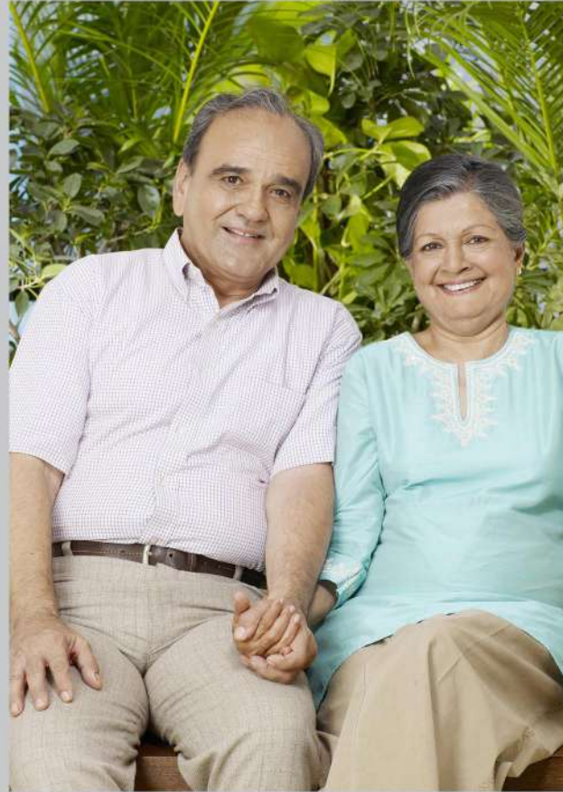
Senior Citizen Garden