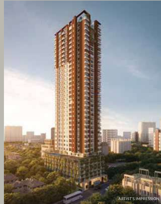
RISHABRAJ PHOENIX - Borivali W MahaRera No. P51800033878