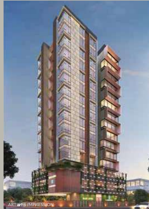
BLUE LOTUS - Khar W MahaRera No. P51800033826