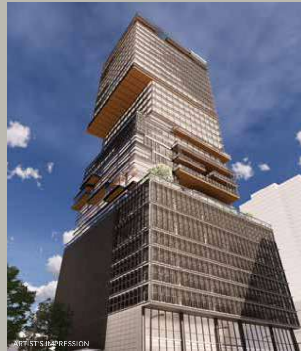
63 GOLD MEDAL AVENUE - Goregaon W MahaRera No. P51800027330