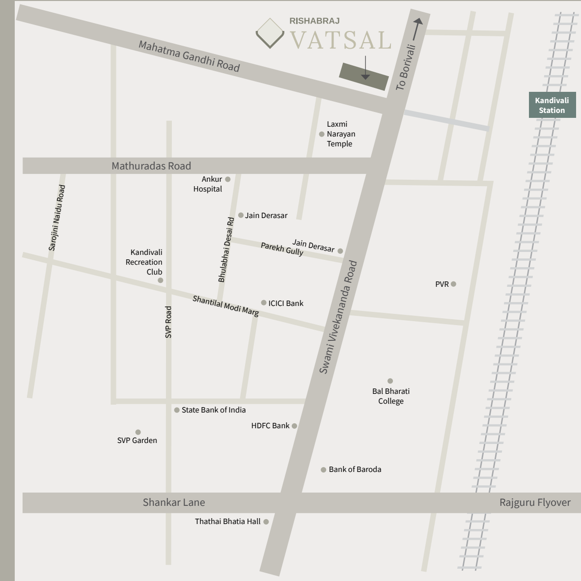
Site Address: Rishabraj Vatsal, SV Rd, Kandivali, Parekh Nagar, Kandivali West, Mumbai 400067