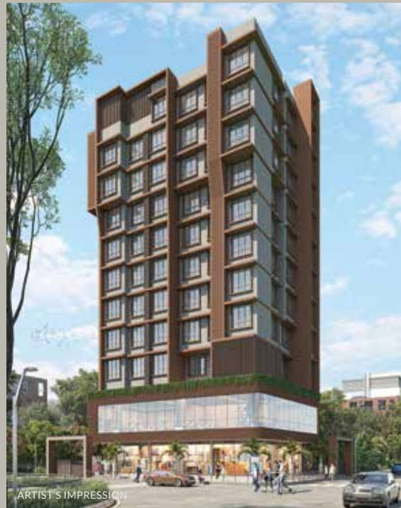
RISHABRAJ PERCY - Borivali W MahaRera No. P51800034819