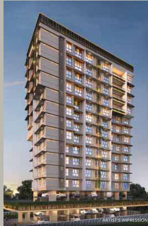
RISHABRAJ PARKVISTAS - Borivali W MahaRera No. P51800033442