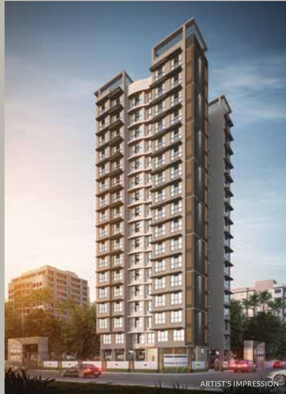
RISHABRAJ SAMAJ DARSHAN - Kandivali W MahaRera No. P51800010479