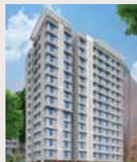
EVERGREEN ANDHERI EAST