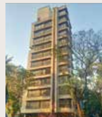
PENKAR PLAZA KHAR