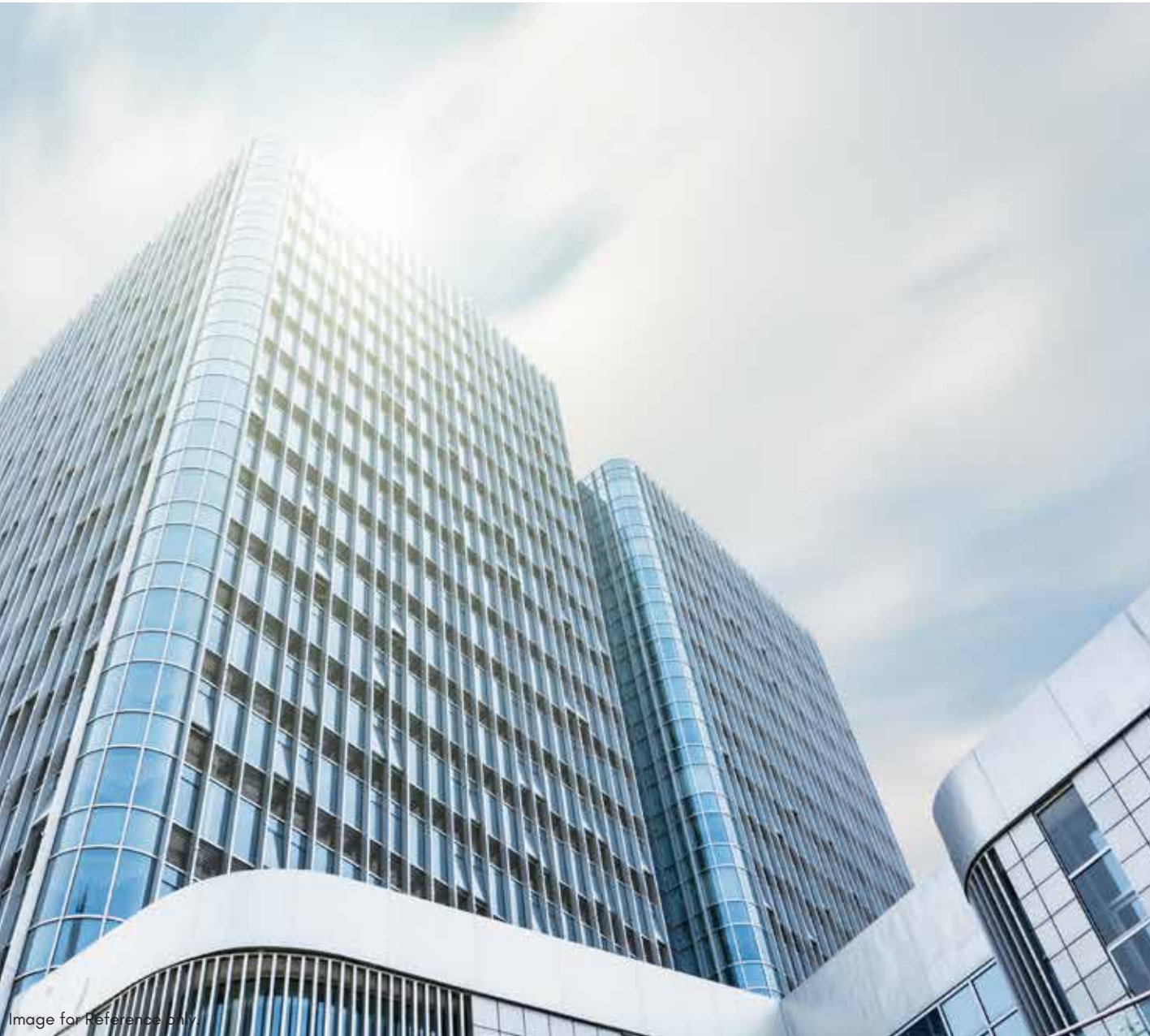
Image for Reference only

LIVE CLOSE TO WORK. WITH BKC AROUND THE CORNER, NOW COMMUTES MADE EFFORTLESS.