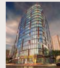
BUSINESSS HUB ANDHERI EAST