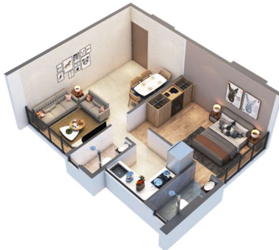
1 BHK ISOMETRIC VIEW

* All internal dimension for carpet area are from unfinished wall surfaces * Minor variation up to (+/-)3% in actual carpet areas may occur on account of site conditions/ columns/finishesh etc.