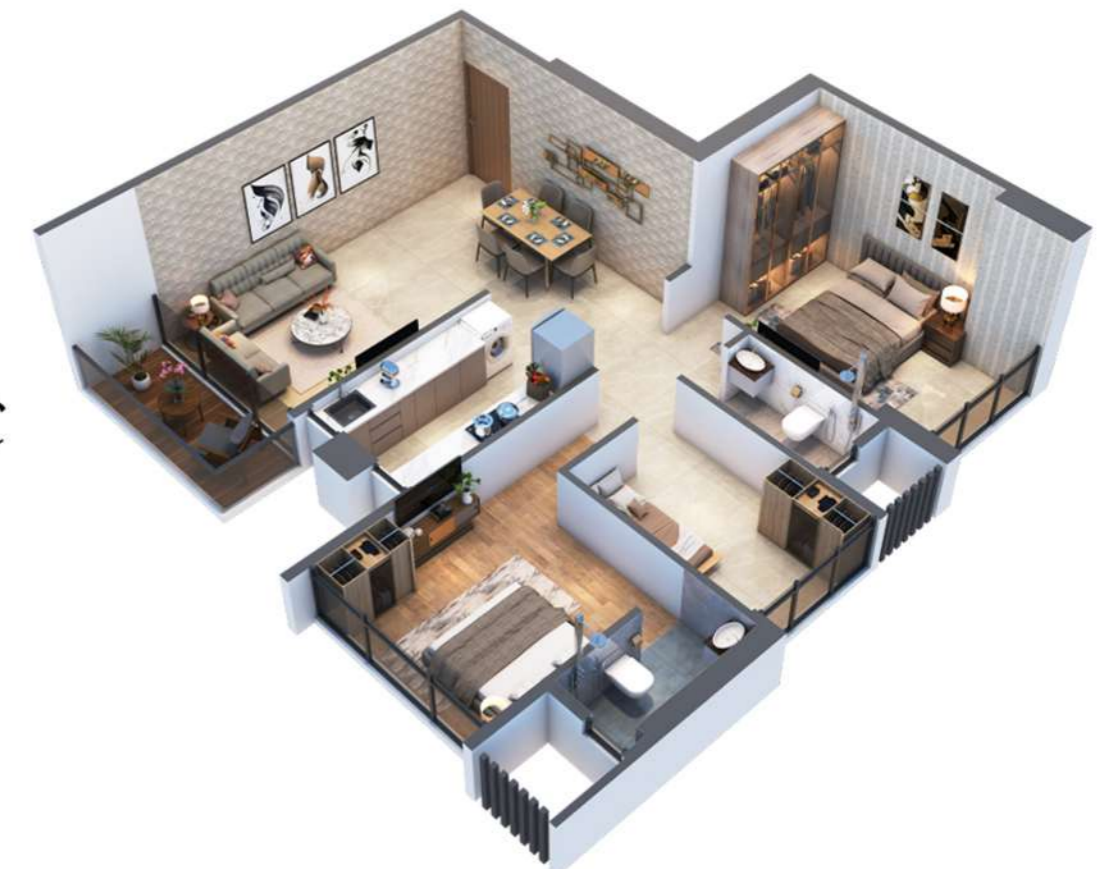
2.5 BHK ISOMETRIC VIEW

* All internal dimension for carpet area are from unfinished wall surfaces * Minor variation up to (+/-)3% in actual carpet areas may occur on account of site conditions/ columns/finishesh etc.