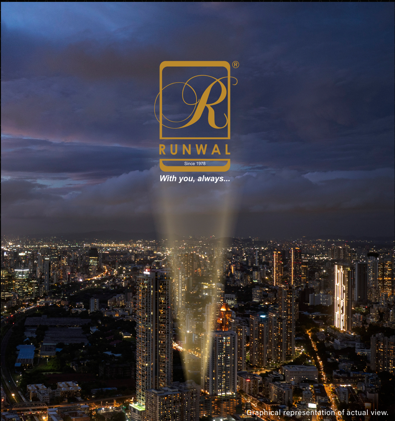
Graphical representation of actual view.