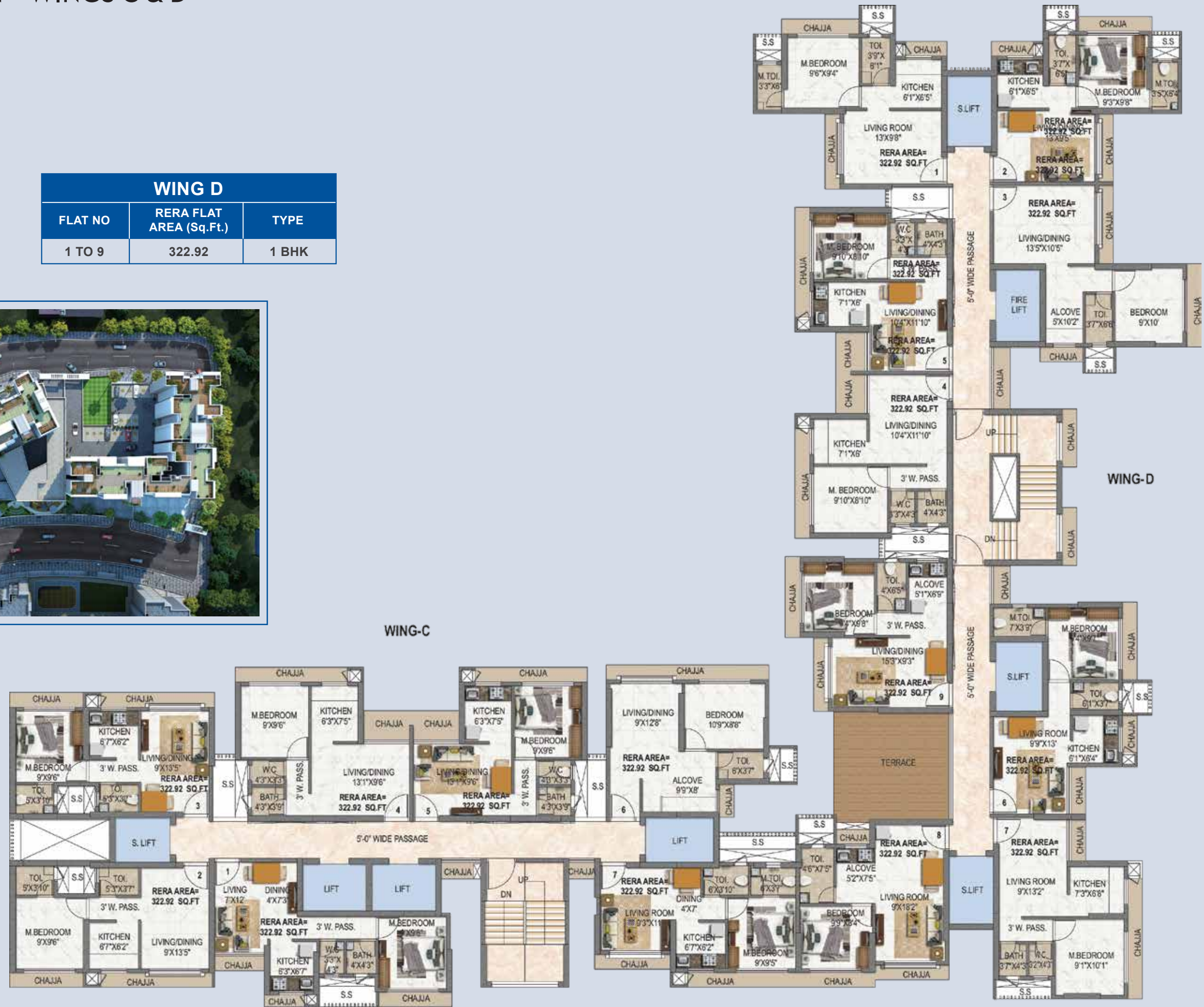
1ST FLOOR PLAN (WING C & D)