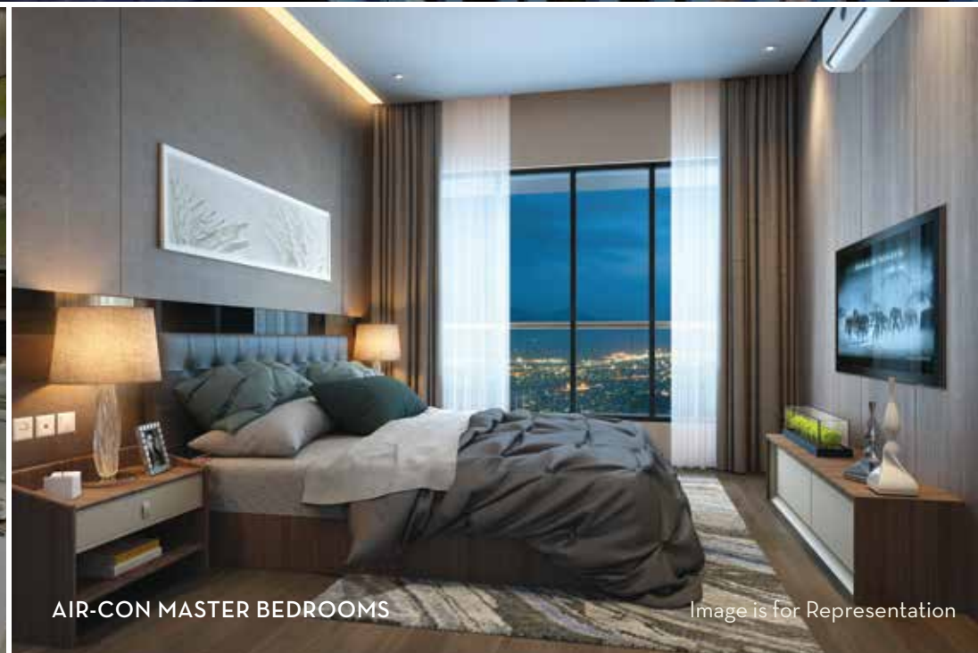
AIR-CON MASTER BEDROOMS