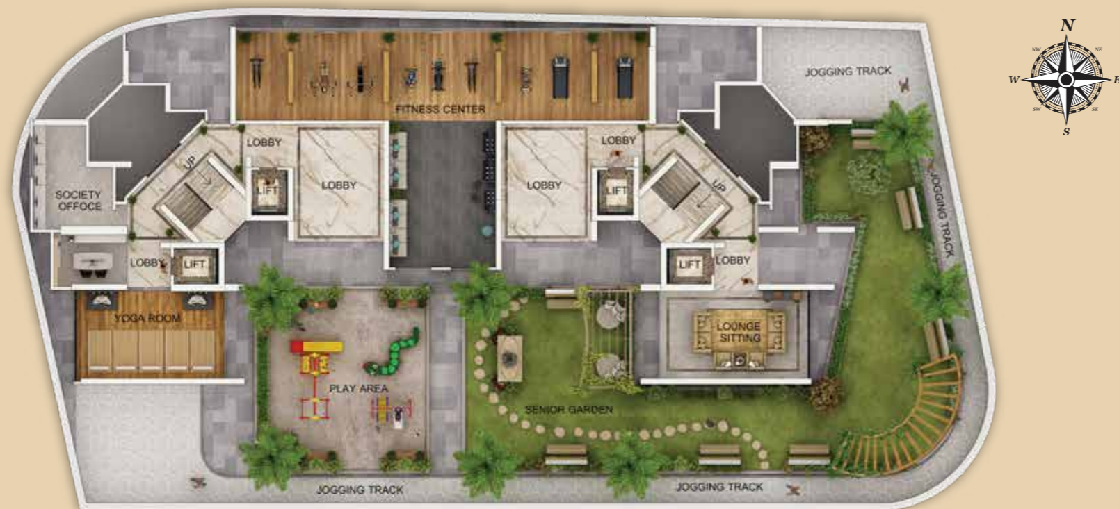
AMENITIES FLOOR PLAN

Total Amenity Area- 8075 Sq.Ft. | Garden & Kid's Play Area- 6300 Sq.Ft. | Fitness Centre Area- 1775 Sq. Ft.