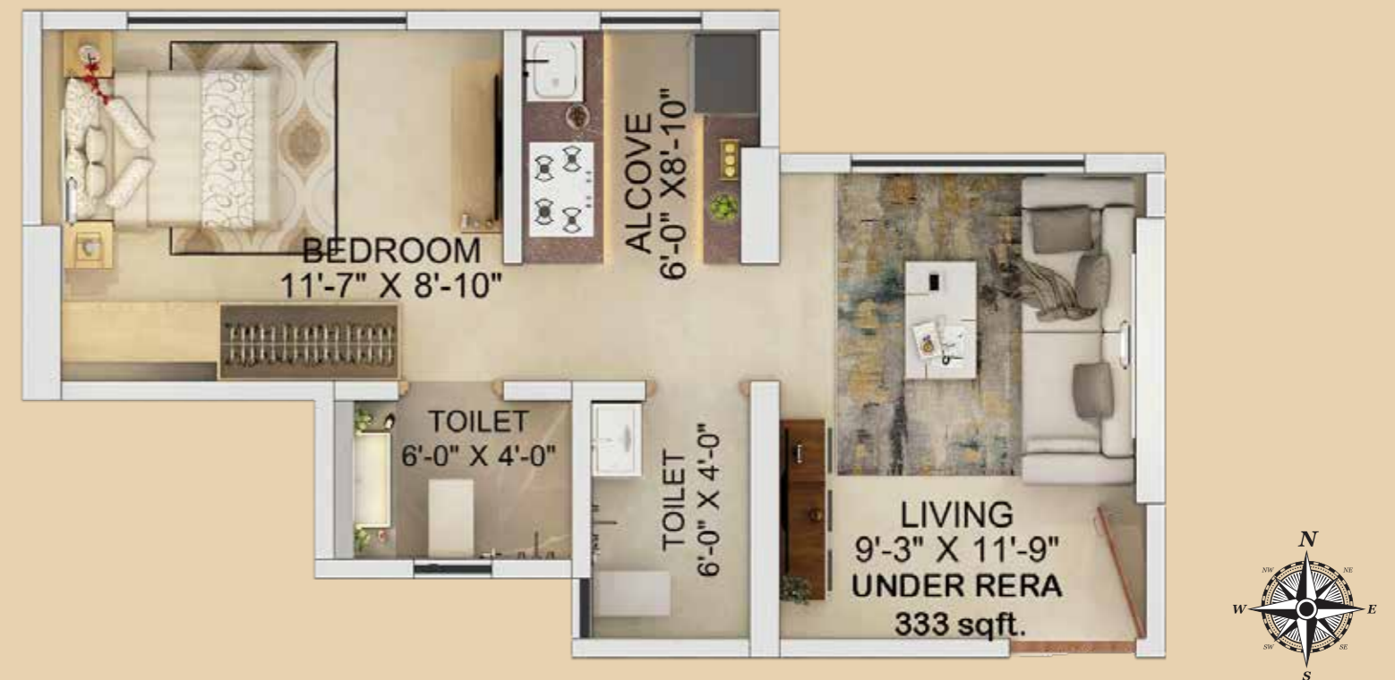
1 BHK SMART

Total Amenity Area- 8075 Sq.Ft. | Garden & Kid's Play Area- 6300 Sq.Ft. | Fitness Centre Area- 1775 Sq. Ft.