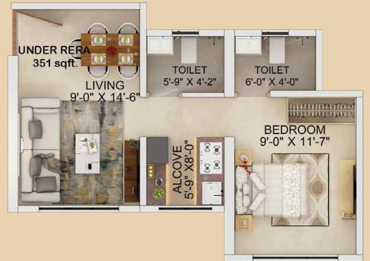
1 BHK LUXURY