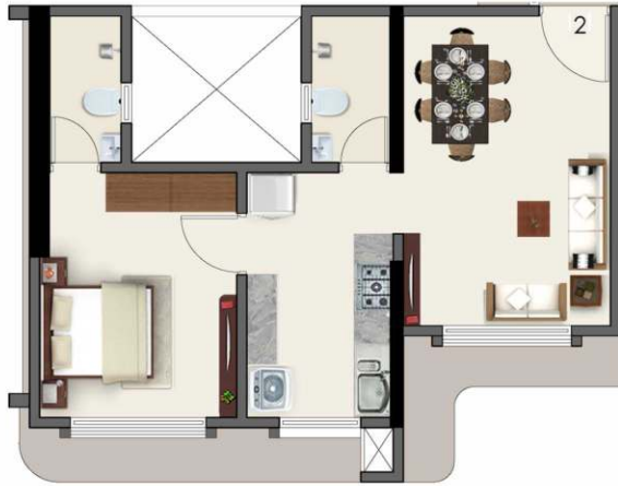
1BHK 415 Carpet

Living : 14'11" x 10'0" C-Toilet : 7'0" x 3'9" Kitchen : 11'10" x 7'0" M-Toilet : 7'0" x 3'6" Master Bedroom : 11'10" x 9'6"