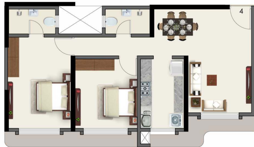
2BHK Grand 667 Carpet

Living : 10'0" x 16'5" C-Toilet : 4'0" x 7'0" Kitchen : 7'0" x 12'0" M-Toilet : 6'5" x 4'7" Master Bedroom : 9'6" x 12'0"