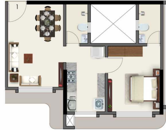
1BHK Smart 420 Carpet

Living : 14'11" x 10'0" C-Toilet : 7'0" x 3'9" Kitchen : 11'10" x 7'0" M-Toilet : 7'0" x 3'6" Master Bedroom : 11'10" x 9'6"