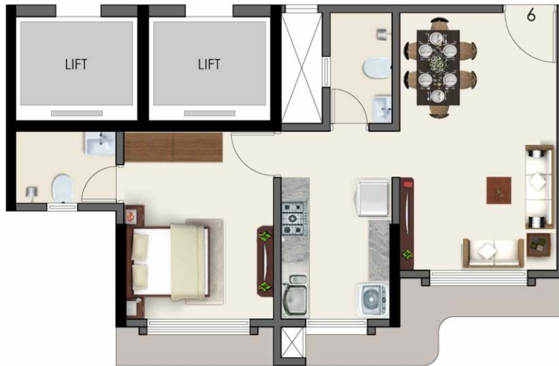
1BHK Luxury 440 Carpet

Living : 14'11" x 10'0" C-Toilet : 7'0" x 4'0" Kitchen : 11'10" x 7'0" M-Toilet : 7'0" x 4'0" Master Bedroom : 11'10" x 9'6"