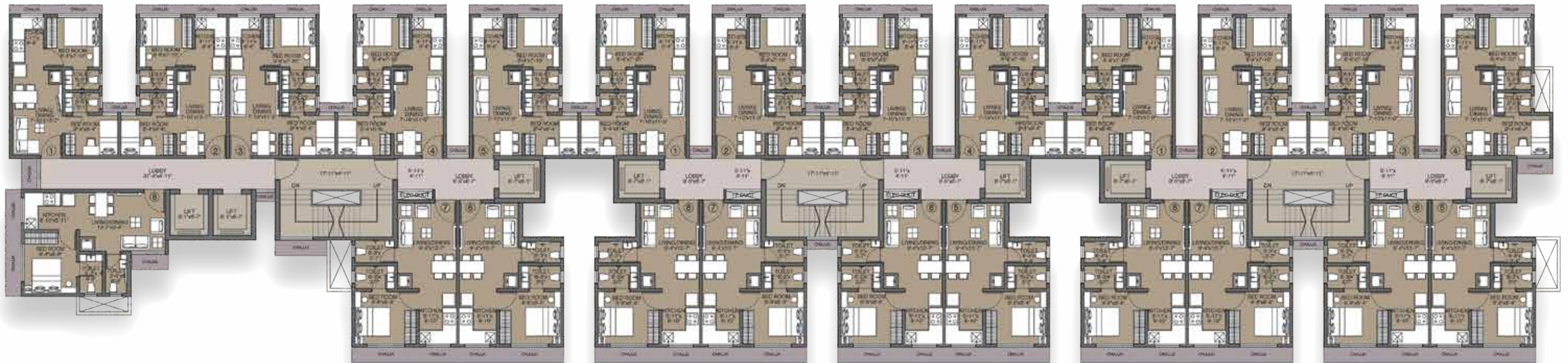
WING A (G+23 FLOORS)