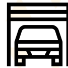
MULTI LEVEL CAR PARKING