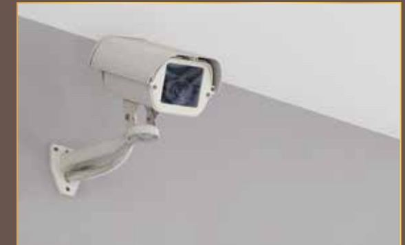
24/7 CCTV Surveillance