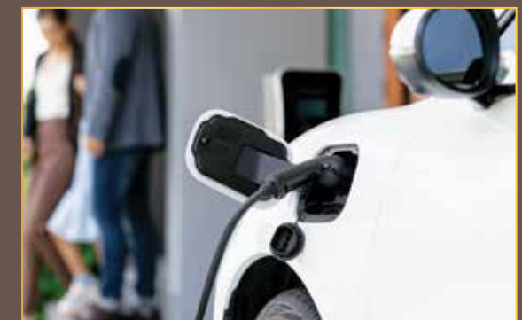
EV Charging Point