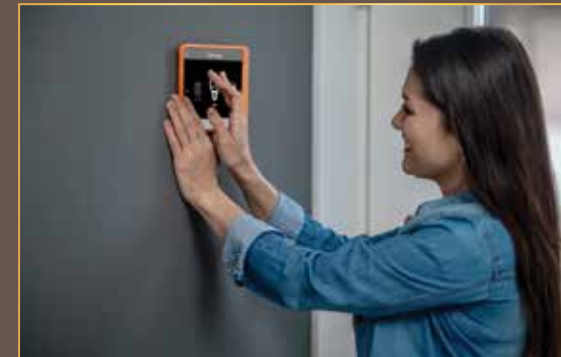
Video Door Phones & Intercom