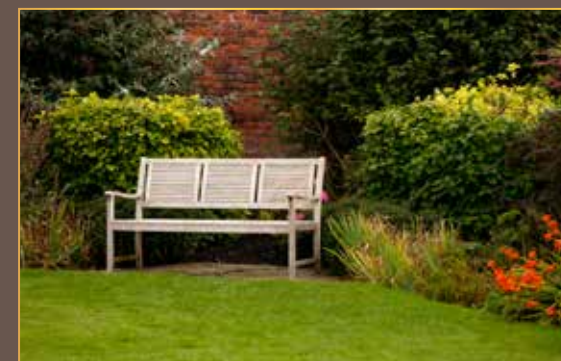
Senior Citizen Area