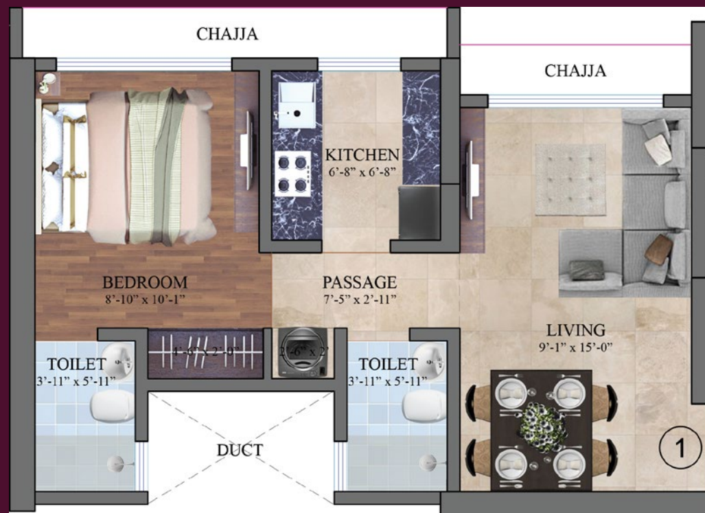
FLAT NO. 1 (1 BHK) - 378 SQ. FT. RERA CARPET